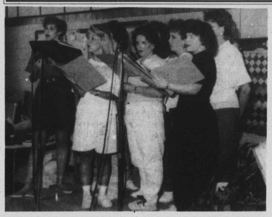
FESTIVAL ENTERTAINMENT - The Sonshine Singers of the First Baptist Church of Tahoka provided entertainment at the Hospital Auxiliary Fun/Food Festival Saturday. The women's choral group sang several songs.