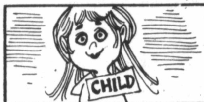
In old England, the word "child" referred only to a girl.

When I see my parents caring for my children, as my grandparents cared for me, I am reminded of that loving legacy. Grandparents are truly God's gift to parents — and children.