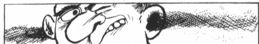
The human ear can hear sounds ranging in loudness from 10 decibels to 140 decibels.