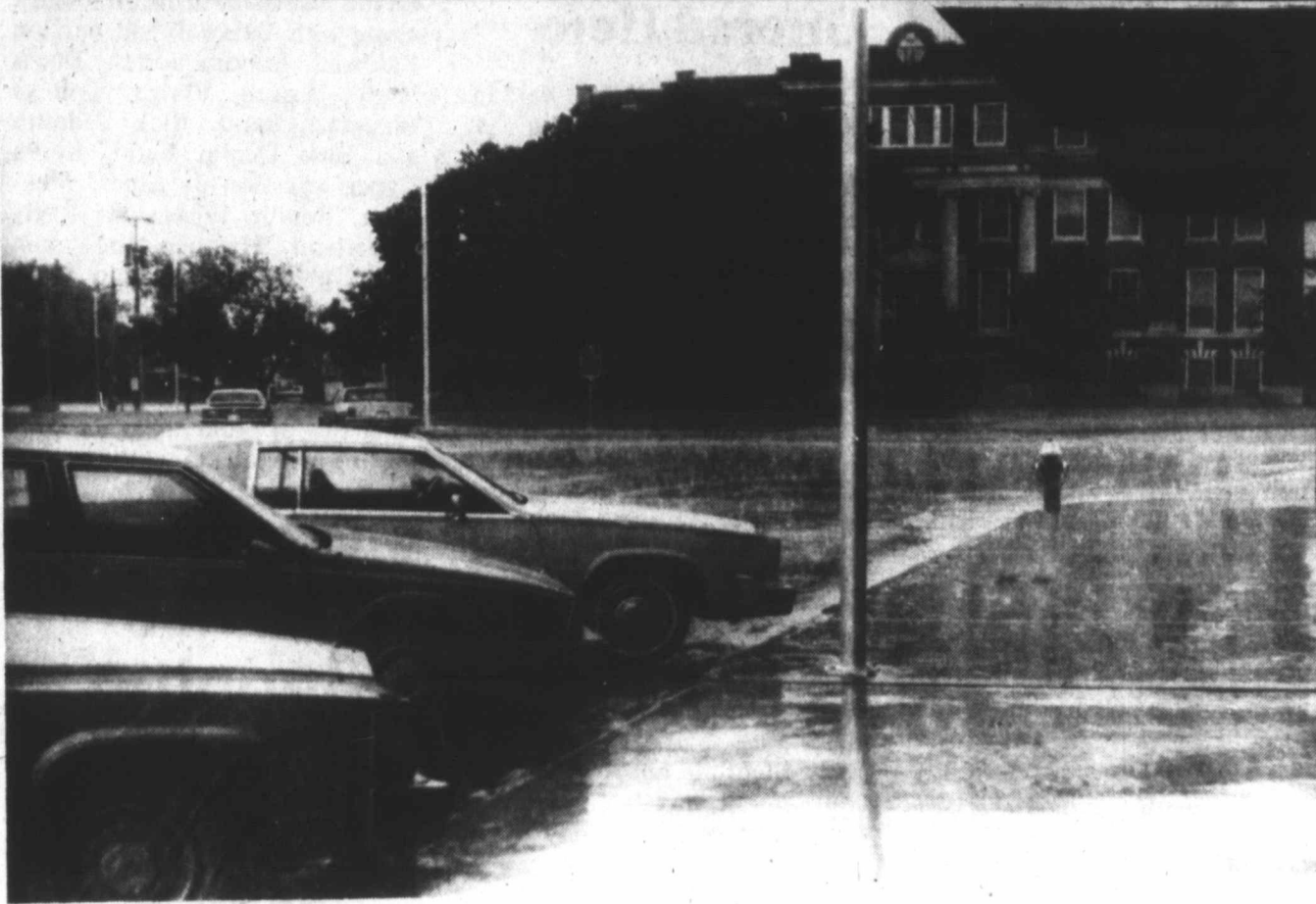
AFTERNOON SHOWER — Tahoka received a welcomed 30-minute shower last Thursday, and a smaller amount of rain on Tuesday, when there were reports of heavier rain east of town.