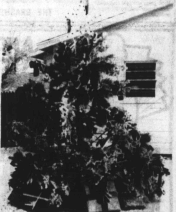
BEST DECORATED TREE — This ice covered tree was judged the best decorated outside tree by the Tahoka Garden Club sponsored Christmas Lighting Contest.