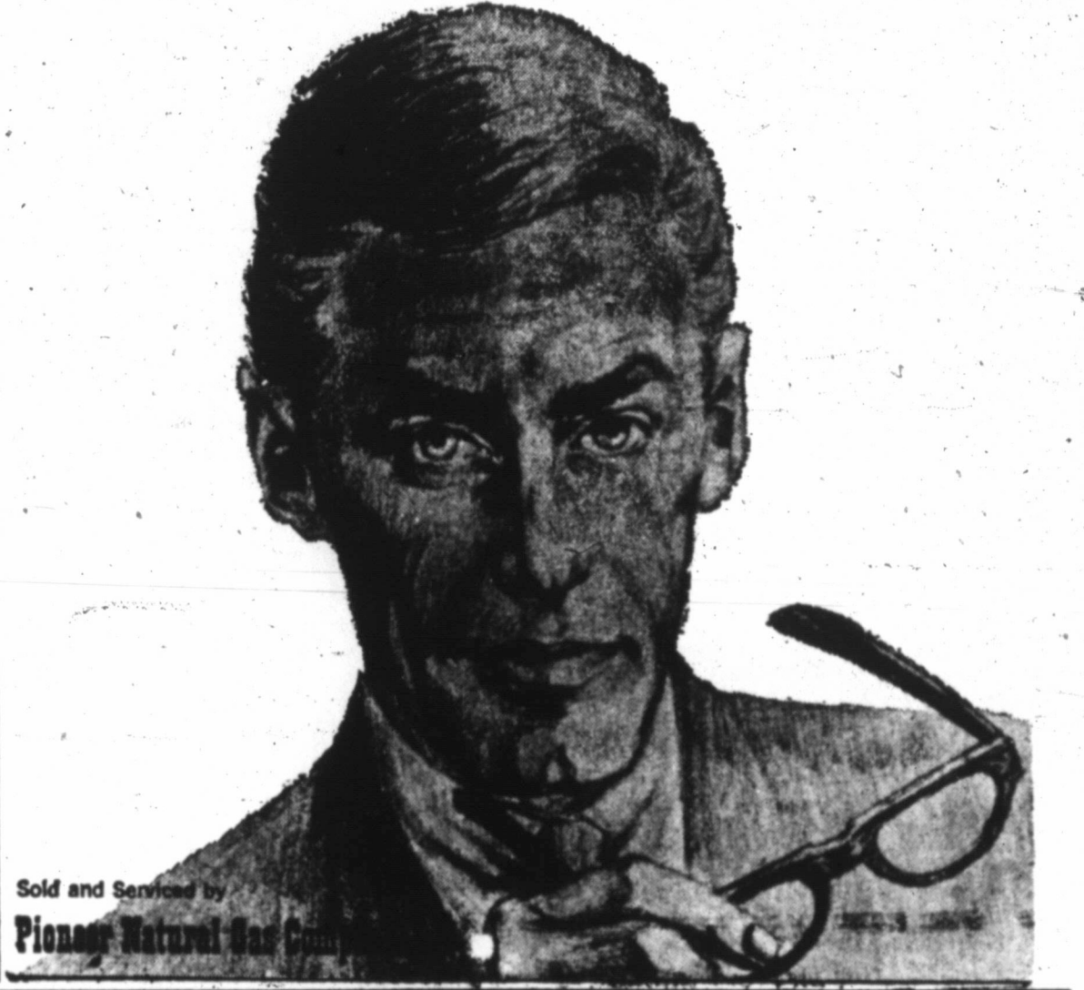
Sold and Serviced by Pioneer Natural Gas Co.

Play it smart. Give gas air conditioning a careful, hard-nosed look. Really get into it and you'll find there are no moving parts in the cooling cycle... so there's minimum maintenance. Check into the service. It's provided by Pioneer so you are sure it's dependable. And gas is famous for economy — no need to ration coolness. Play it smart and you'll play it cool for trouble-free years and years.