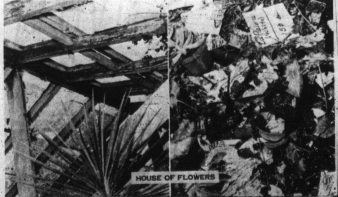
HOUSE OF FLOWERS