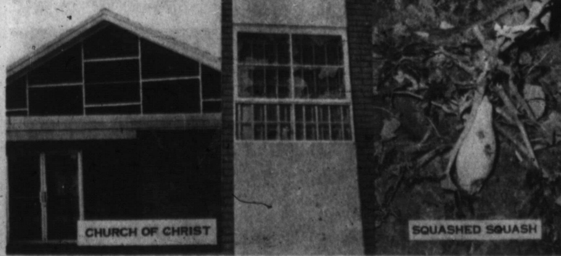
CHURCH OF CHRIST