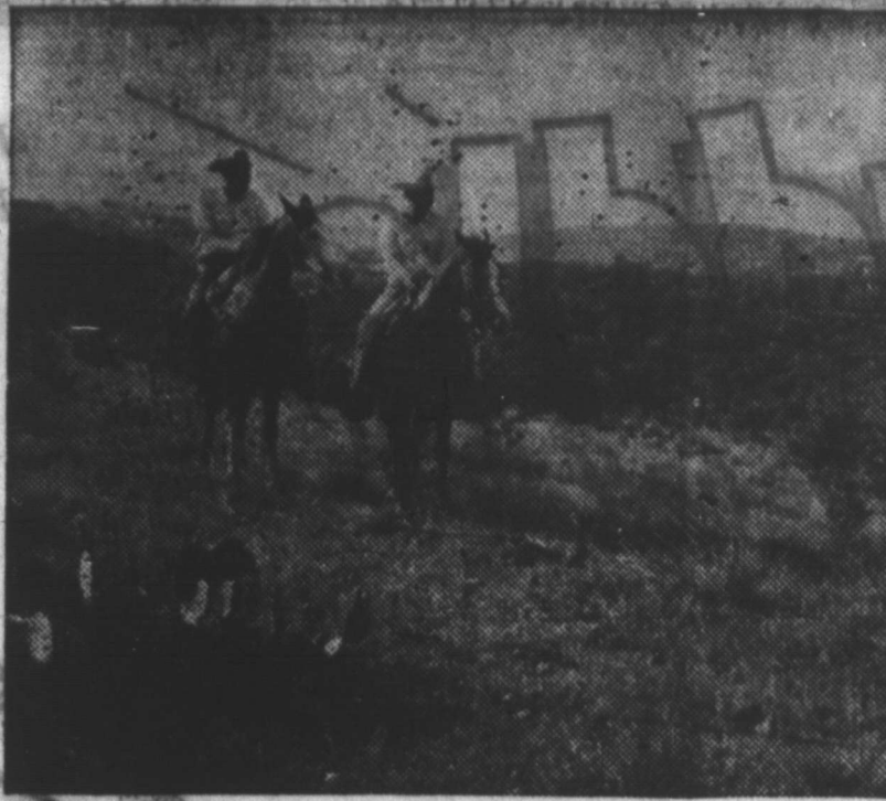
RIDING THE DEVIL'S BACKBONE —An area of growing tourist popularity in the hill country southwest of Austin, where these two ranchers are riding along the Devil's Backbone, a scenic range of hills, not far from Canyon Dam Lake. President Lyndon B. Johnson's famed "LBJ Ranch," only a few miles north of the area, has served to focus motorists' attention to this region.