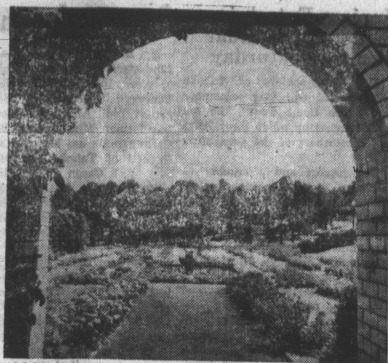
ROSE CAPITAL —Municipal Rose Garden at Tyler is one of the finest in the nation with 26,000 bushes and 375 varieties which bloom from May until November. Upwards of 50,000 persons visit the garden each year. The 1963 Tyler Rose Festival will be held October 18, 19 and 20.