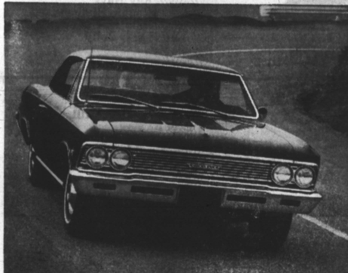
Chevelle Malibu Sport Coupe—with eight new standard safety features, including outside rearview mirror and shatter-resistant inside mirror. Always check both mirrors before pulling out to pass.

The way people are snapping up buys on new Chevelle V8's at your Chevrolet dealer's... you'd think they're really getting away with something.