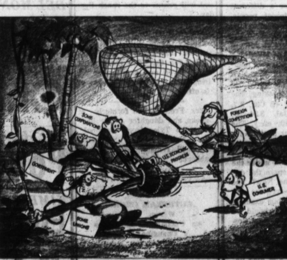
Monkeys are caught by filling a coconut shell with chopped coconut meat. The monkeys grasp a fistful and, unwilling to let any go, cannot withdraw their paws. So, they are easy victims. The U.S. consumer is not yet as scrawny as shown, but unless there is a more equitable division of the productivity increases, he will get that way. One of the three American groups must let go and set an example—or all will be captured and, along with the consumer, all will suffer.