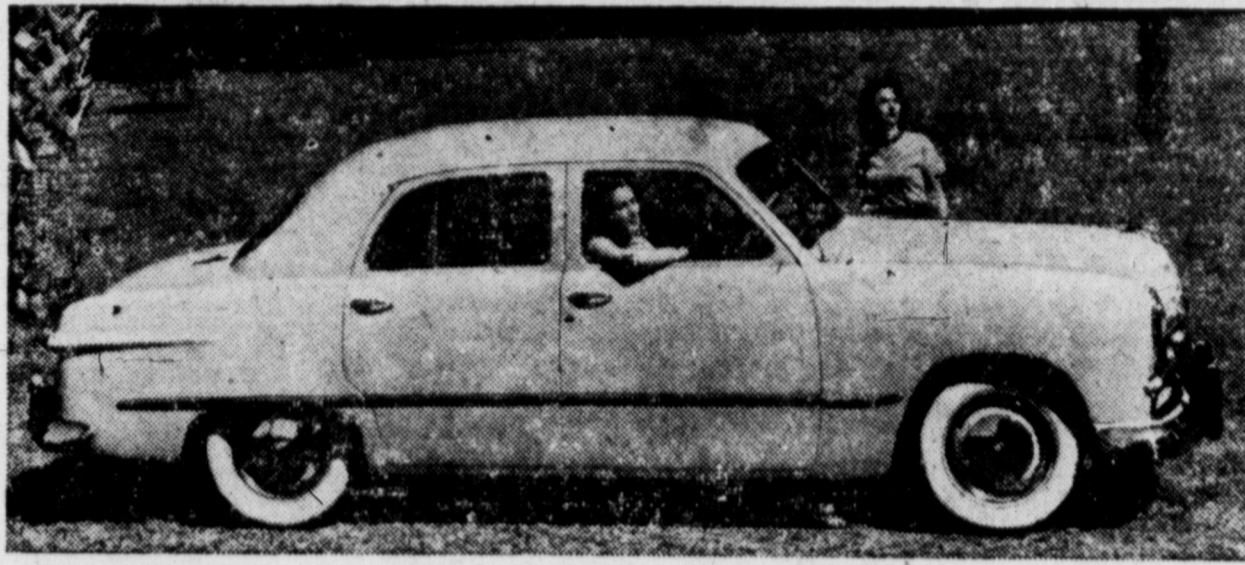
The revolutionary new Ford four-door sedan for 1949 is lower, wider, roomier and provides nearly 25 per cent more visibility.