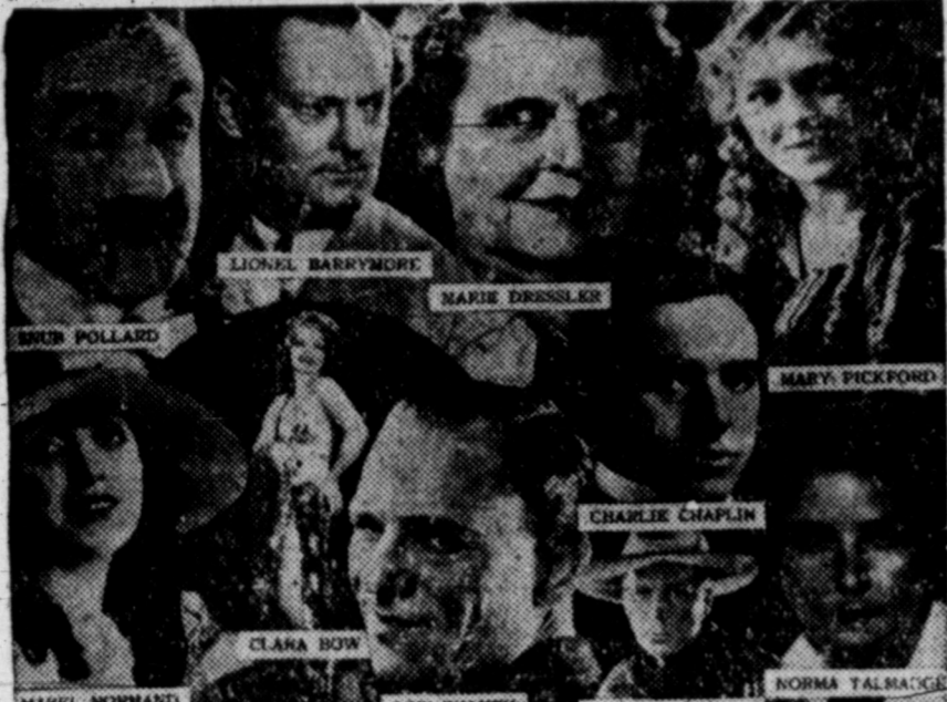
ALL THESE STARS TOGETHER IN THE GOOD OLD DAYS SHOW

"The Good Old Days" are coming back—not for long to be sure but long enough for every movie fan in Tahoka and Lynn County to take advantage of the chance to see the stars that pioneered a new industry and helped make it one of America's Big Three . . . . . "THE GOOD OLD DAYS" will open at the Rose theatre on Saturday, January 25th at a midnight show and will then show Sunday, Monday, and Tuesday.