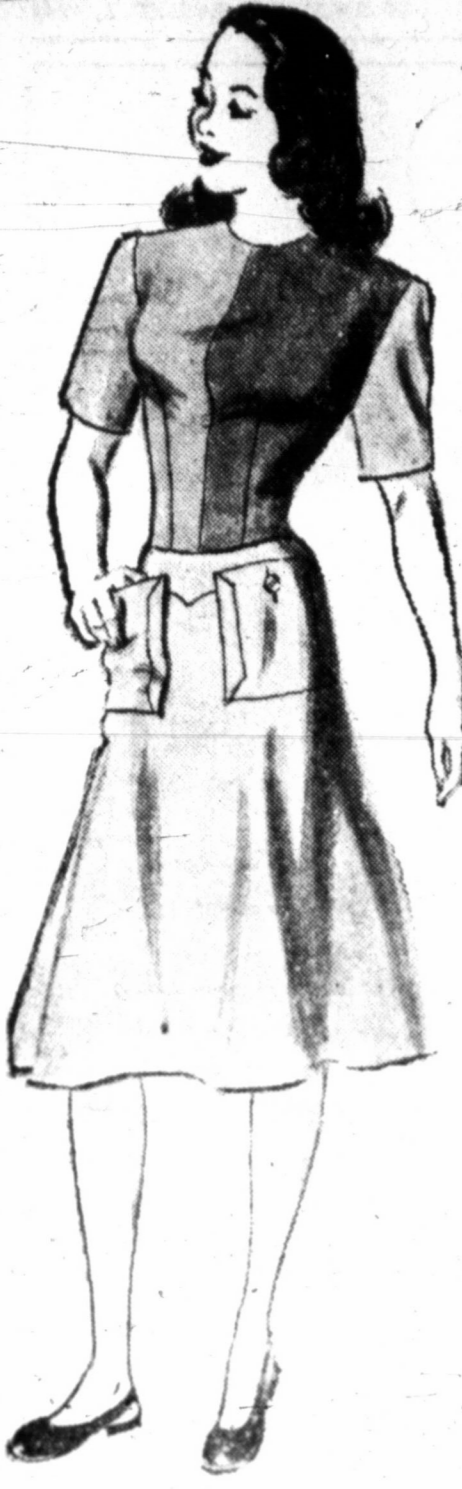
Bunny-soft figure flatterer is Doris Bodson's "Hug-Me-Tight" in all wool Doe Flannel. Snug bodice, baby neckline, flared skirt. Beautiful color combination of Beige, Aqua, and Lime. Sizes 7 to 15. $12.95