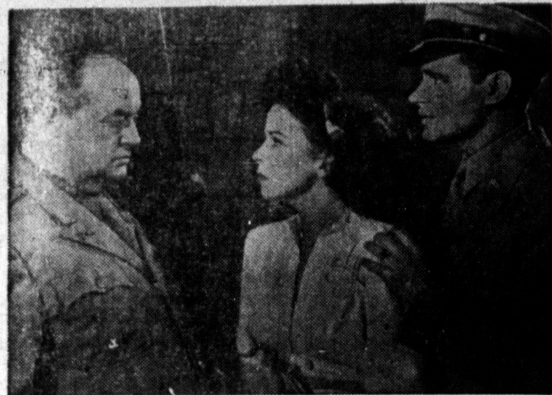
Sydney Greenstreet seems to be intruding upon the privacy of Ida Lupino and William Prince in this scene from the hilarious comedy, "Pillow Talk."

State leaders in the Home Guard are advocating universal military training to be given our young men