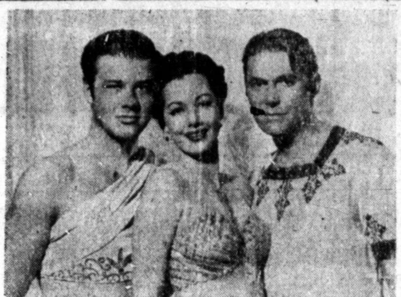
Turhan Bey, Maria Montez and Jon Hall are starred in "Sudan," photographed in Technicolor, with Andy Devine and George Zucco