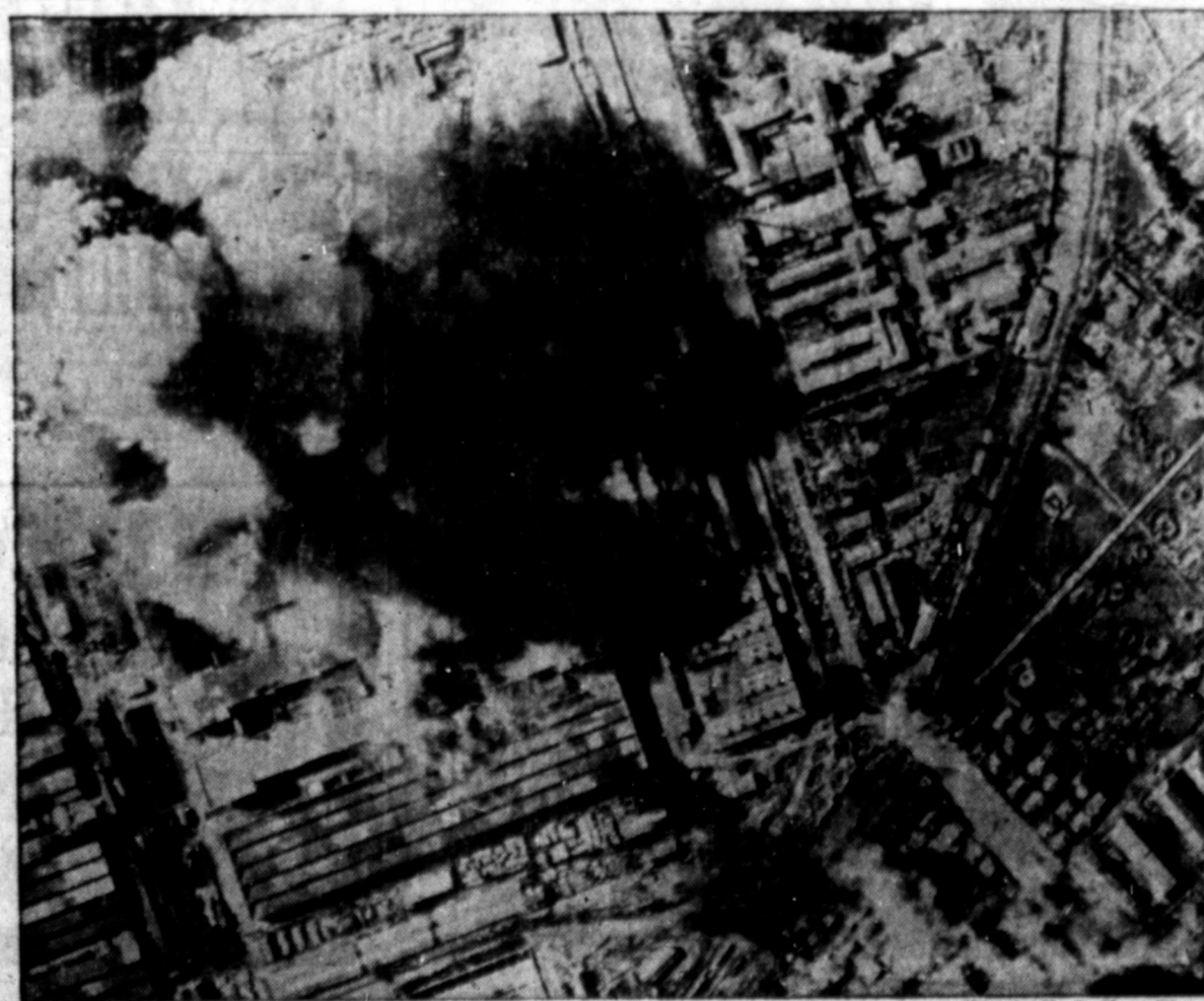
Navy bombing planes have just scored direct hits in an attack on an aircraft engine plant during a strike on the Tokyo area. Help keep the bombs falling with greater purchases of War Bonds during the Mighty Seventh.