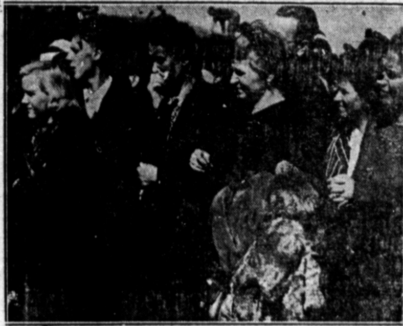
Released by U. S. War Department, Bureau of Public Relations. GERMAN HAUSFRAUEN VIEW HORRORS OF PRISON CAMP —These German women, comfortably dressed and apparently well fed, exhibit varied emotions as they witness atrocious horrors in Camp Buchenwald. With other citizens of Weimar they were put under Military Police escort and marched through the camp by U. S. authorities. Buchenwald was captured by units of General Patton's U. S. Third Army.