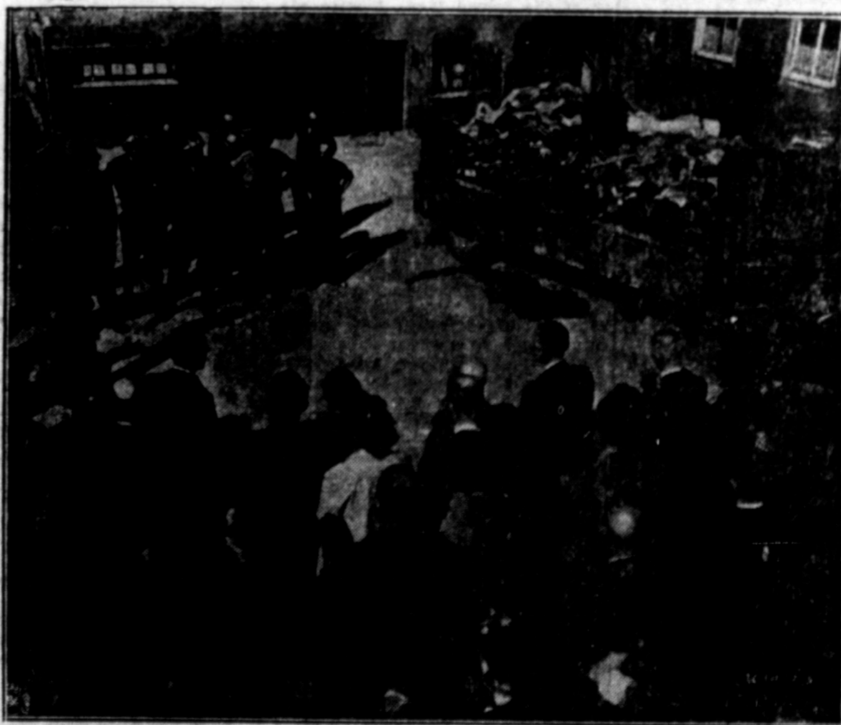
GERMAN CIVILIANS WITNESS ATROCITIES AT BUCHENWALD—A truckload of prisoners dead at the Nazi horror mill.