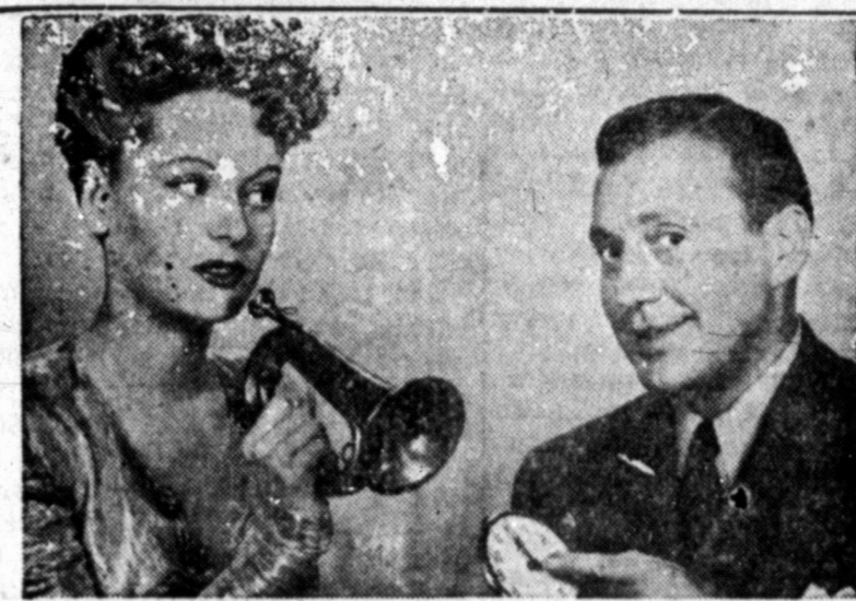
Jack Benny waits for the stroke of twelve before the horn is blown to end the world, a scene from "The Horn Blows At Midnight."