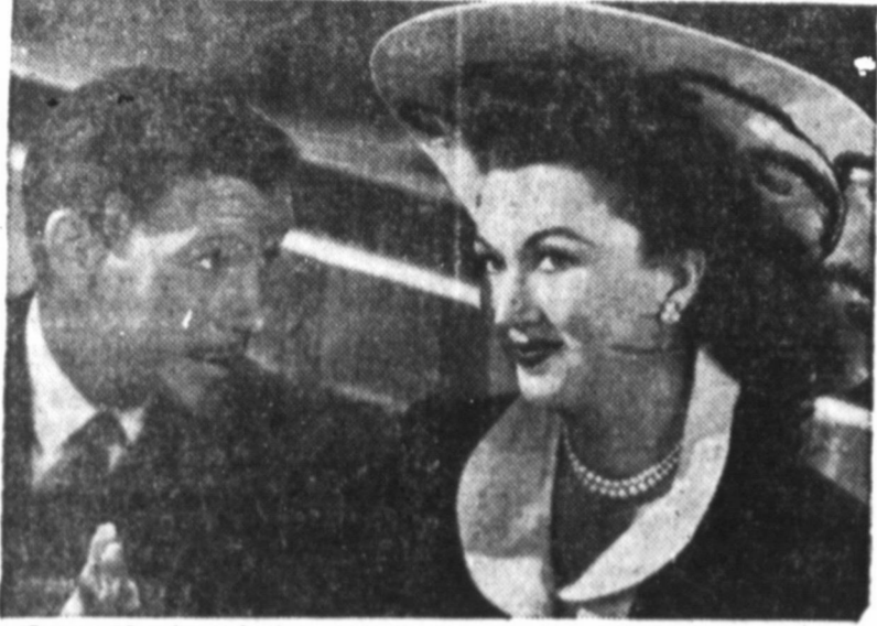
George Murphy and Ginny Simms are co-stars in the romantic musical, MGM's "Broadway Rhythm," with Charles Winninger.

AT WALLACE PREVUE SATURDAY, SUNDAY AND MONDAY