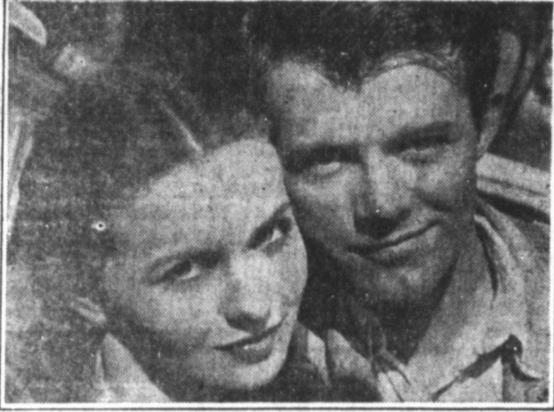
America's greatest sport, sulky racing, comes to the screen in "Home in Indiana." stars for those who love horses and racing.

AT ROSE PREVUE SATURDAY, SUNDAY, MONDAY, TUESDAY