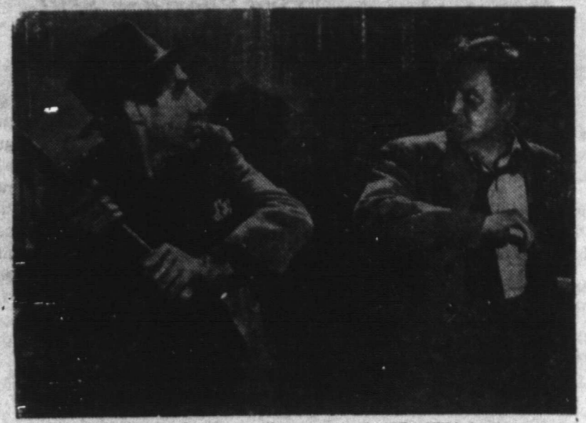
There's plenty of action... as well as mystery in "The Whistler," starring Richard Dix, with J. Carol Nash, Gloria Stuart and Alan Diechart