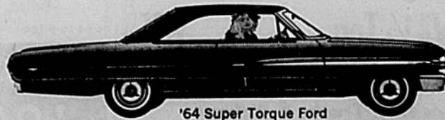
'64 Super Torque Ford

But words alone can't tell you how much Fords have changed. You have to test-drive the cars themselves. The seat of your pants may not be very scientific... but you'll get the message!