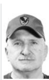
HERE'S TO YOUR HEALTH