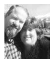
FROM THE PULPIT

Every problem we have to- day is the result of not being able to accept and believe the love of God. We battle with