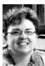
WHAT'S ON MY MIND

I could also use a recording of Tibetan monks