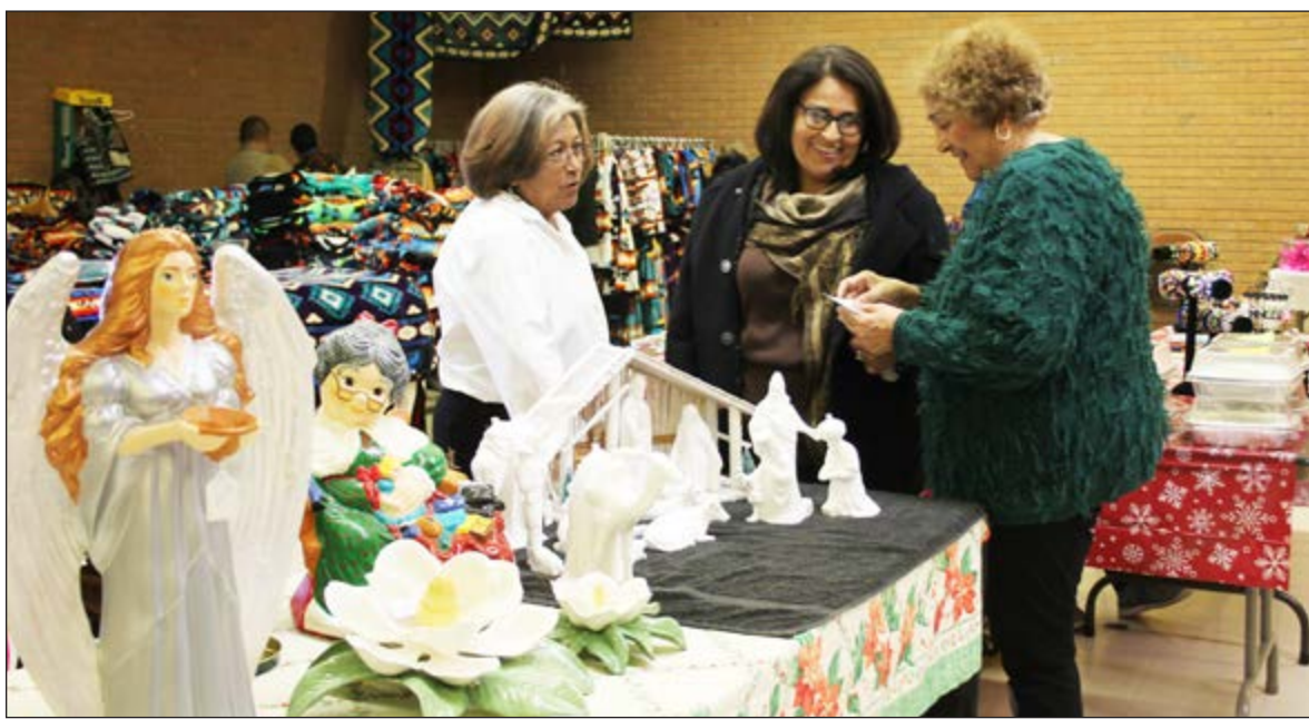
THE HOLIDAY HANDS ARTS AND CRAFTS FAIR was held Dec. 6 at the Crockett County Civic Center. Local shoppers got to take in all kinds of booths featuring clothes, jewelry, unique and handmade gifts.