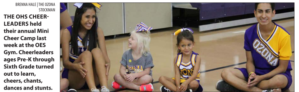
THE OHS CHEERLEADERS held their annual Mini Cheer Camp last week at the OES Gym. Cheerleaders ages Pre-K through Sixth Grade turned out to learn, cheers, chants, dances and stunts.