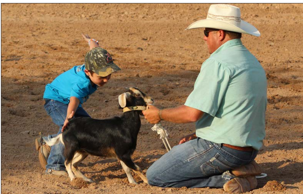
THE 2018 OZONA YOUTH RODEO was held Saturday at the Fair Park Arena. Children of all ages competed in a variety of events. Photos can be purchased from Round-Up Photography at their Facebook page @mysportingpics.