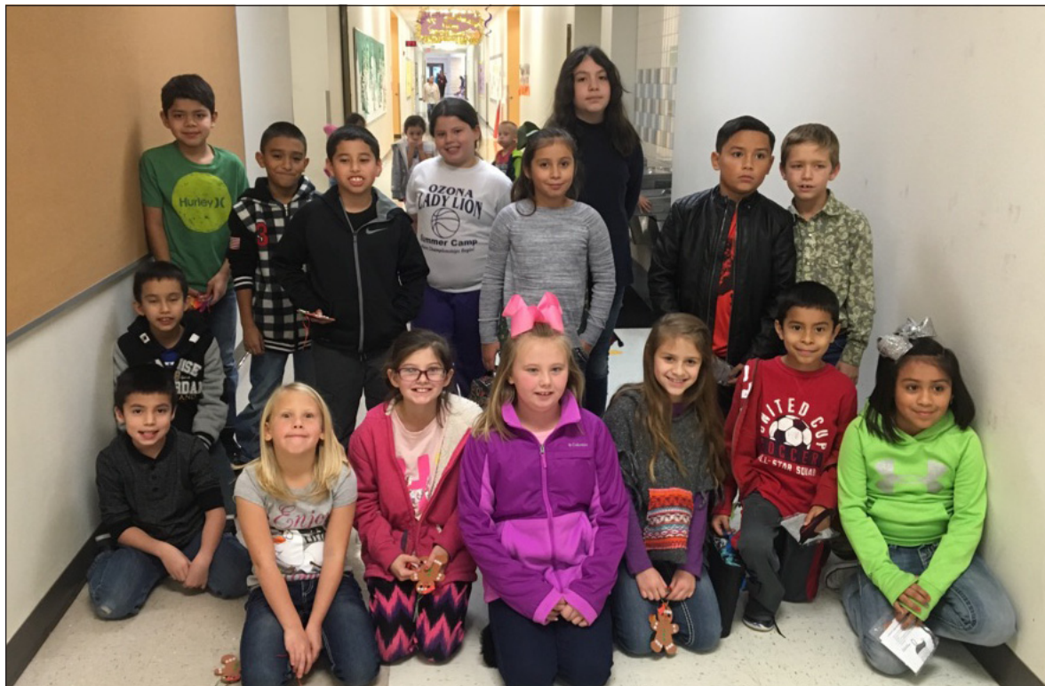
OES LION LEADERS SECOND CYCLE THIRD GRADE