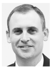
STATE REP. OP ED

Howdy and Happy New Year. As we head into 2017, we are also approaching the beginning of the next session of the Texas Legislature. Unlike the U.S. Congress which meets year round, our state legislature meets for just 140 days every two years.