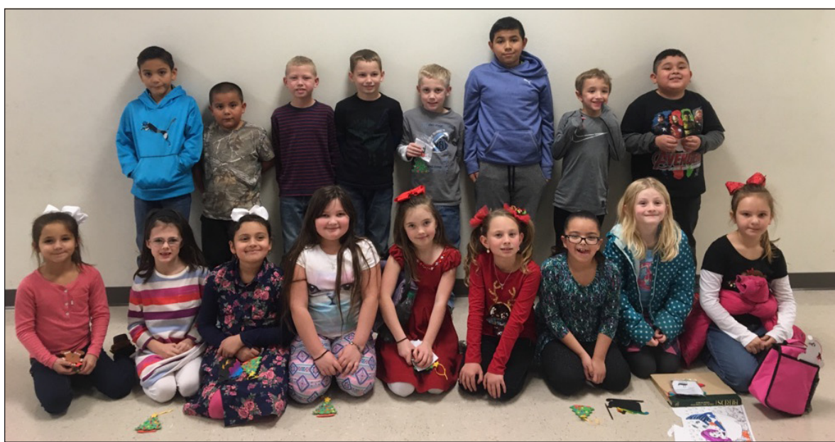
OES LION LEADERS SECOND CYCLE SECOND GRADE