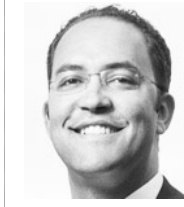
HURD ON THE HILL WILL HURD

that stifle job growth and innovation, among others. It has always been my highest priority to keep Americans safe from harm. As our relationship with Russia becomes increasingly complicated, ISIS continues to terrorize