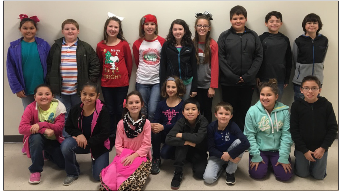
OES LION LEADERS SECOND CYCLE FIFTH GRADE