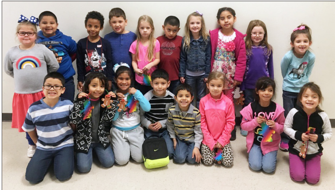
OES LION LEADERS SECOND CYCLE FIRST GRADE