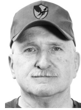
HERE'S TO YOUR HEALTH

I submit a portion of my response to a "Here's To Your Health" reader, something for all to consider in 2017 about being responsible for your own health and wellbeing.