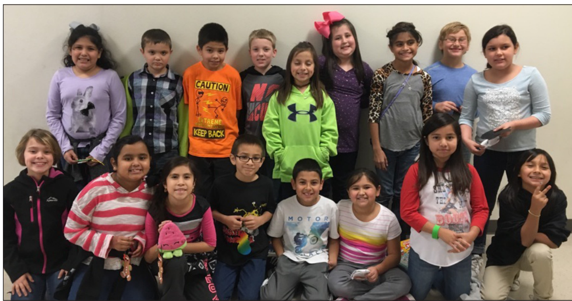
OES LION LEADERS SECOND CYCLE FOURTH GRADE