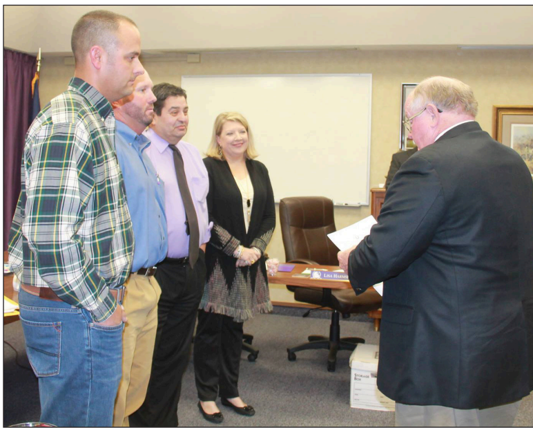
MELISSA PERNER | THE OZONA STOCKMAN

The board approved a resolution to the State Legislature that states that the State of Texas make a strong com-