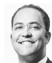
HURDON THE HILL WILL HURD