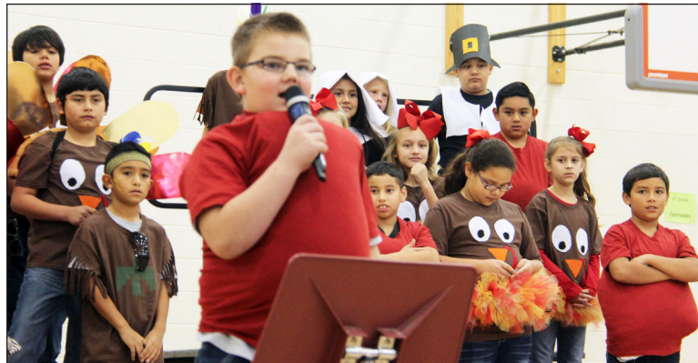
THE THIRD GRADERS performed a Thanksgiving Musical on Nov. 22.

Youth Center Calendar of Events HIGH SCHOOL: Monday: 7-10 p.m.; Tuesday: 2-7 p.m.; Wednesday: 7-10 p.m.; Thursday: 2-10 p.m.; Friday: 2 p.m.-midnight and Saturday: 2-7 p.m. CLOSED SUNDAYS 7TH & 8TH GRADE: Tuesday: 7-10 p.m.; Wednesday: 2-7 p.m.; Saturday: 7-10 p.m. OHS MEAL NIGHT: Mondays - 7-10 p.m. 7TH & 8TH MEAL NIGHTS: Every other Tuesday 7-10 p.m.