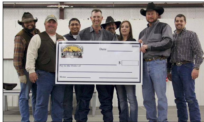
OZONA VOLUNTEER FIRE DEPARTMENT

Crockett County DeerFest distributed their annual donation checks on Jan. 6 at the Fair Park Convention Center.