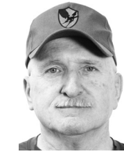
HERE'S TO YOUR HEALTH