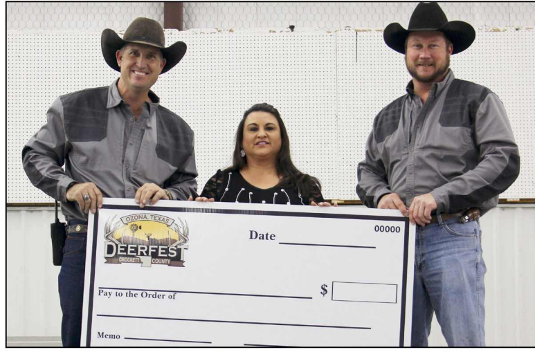
IN CARE OF OZONA FOUNDATION