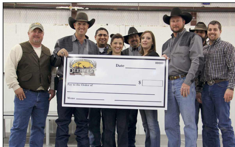
CROCKETT COUNTY 4-H