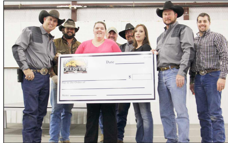
GIRL SCOUTS AND CUB SCOUTS