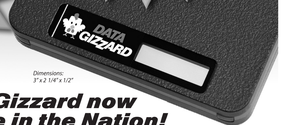
Dimensions: 3" x 2 1/4" x 1/2"

FREE** Data Gizzard come in and find out how!