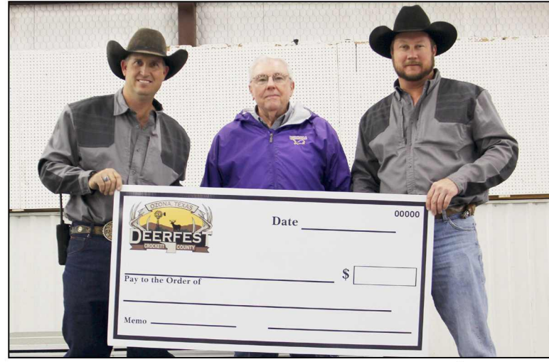
CROCKETT COUNTY YOUTH CENTER