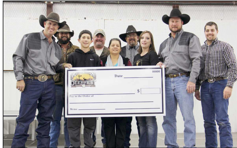
OLPH YOUTH GROUP