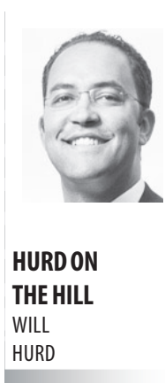
HURD ON THE HILL WILL HURD

My staff and I spent August traveling throughout the 23rd Congressional District of Texas meeting with constituents, business owners and elected officials while eating delicious frozen treats at several of our local Dairy Queens. We called it our DC to DQ tour and it was all about listening to you.