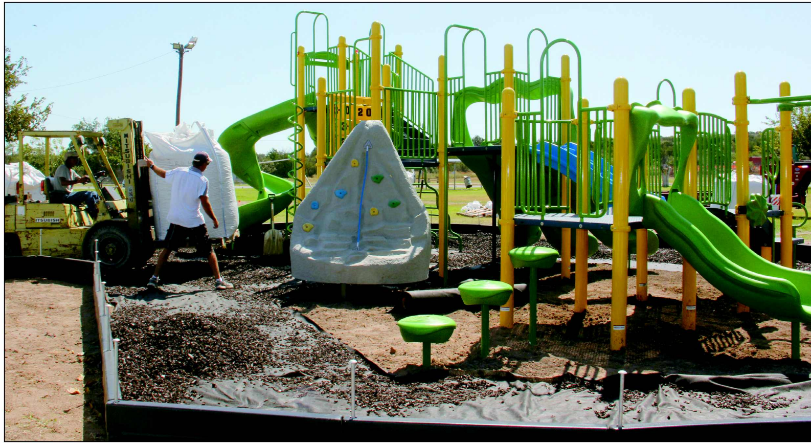
NEW PLAYGROUND EQUIPMENT was installed last week and this week at the park near the rodeo arena. The county purchased the equipment from Play and Park Structures of South Texas, in Austin, for $49,919.16.