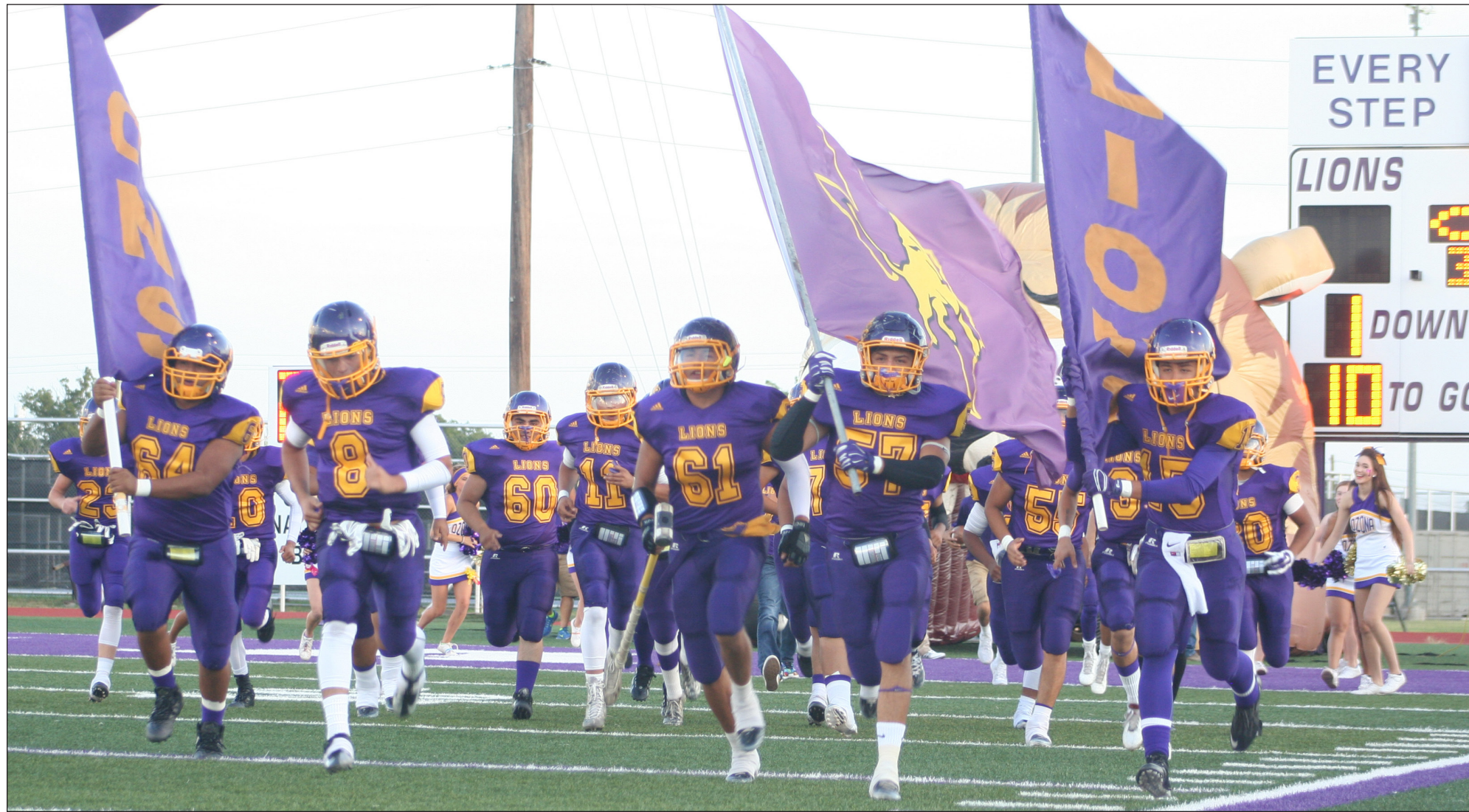
THE OZONA VARSITY LIONS ROAR ON TO THE FIELD TO THE DELIGHT OF OZONA FANS BEFORE THE LIONS 24-22 EXHILARATING WIN over the Crane Golden Cranes on September 11.