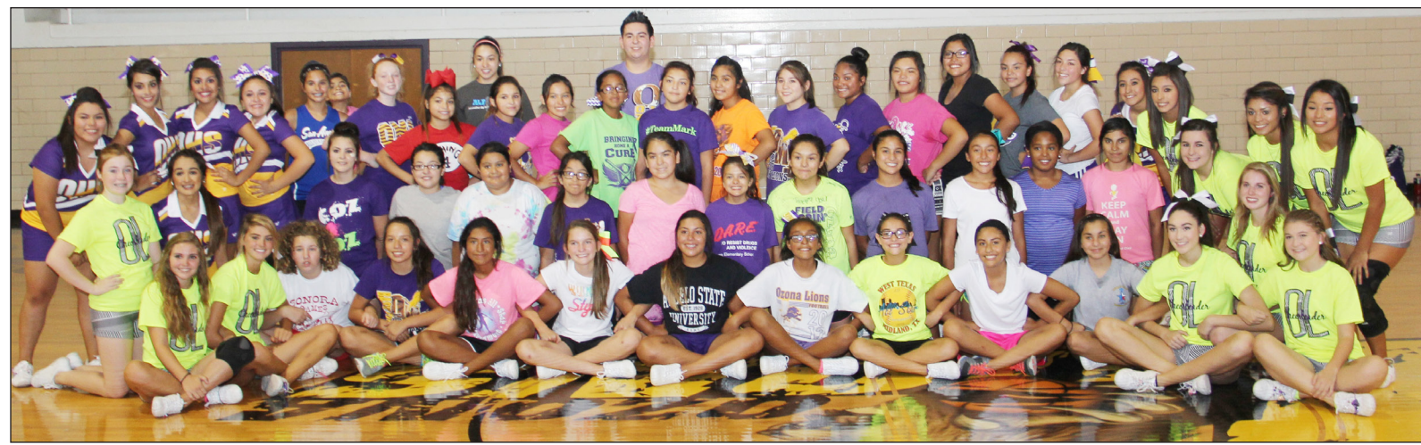
OMS CHEERLEADERS had a cheer camp last week at the OHS Davidson Gym. They were coached by the OHS JV and Varsity Cheerleaders.