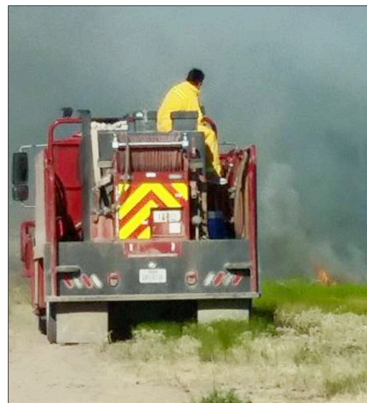
OZONA FIREFIGHTERS fought three grass fires last week. Two were off of County Road 208 north of Ozona and another was located off of State Highway 137 about five miles south of the Reagan County line. Cause of the fires is still being determined. Temperatures this week are expecting to soar into the upper 90s this week with no rain expected. Crockett County is not under a burn ban at this time. Reagan County and Iraan Firefighters also responded.