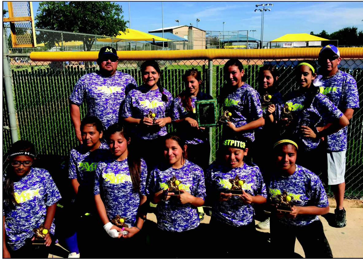
THE 14U OZONA MAYHEM GIRLS SOFTBALL TEAM took consolation at the West Texas All Star Tournament in Midland on July 12.