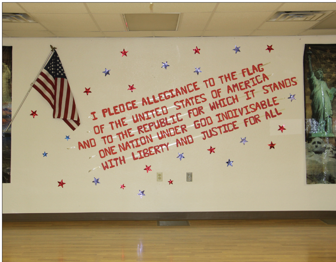
THE CROCKETT COUNTY SENIOR CENTER is all decked out for the Fourth of July, including The Pledge of Allegiance on the center's stage.