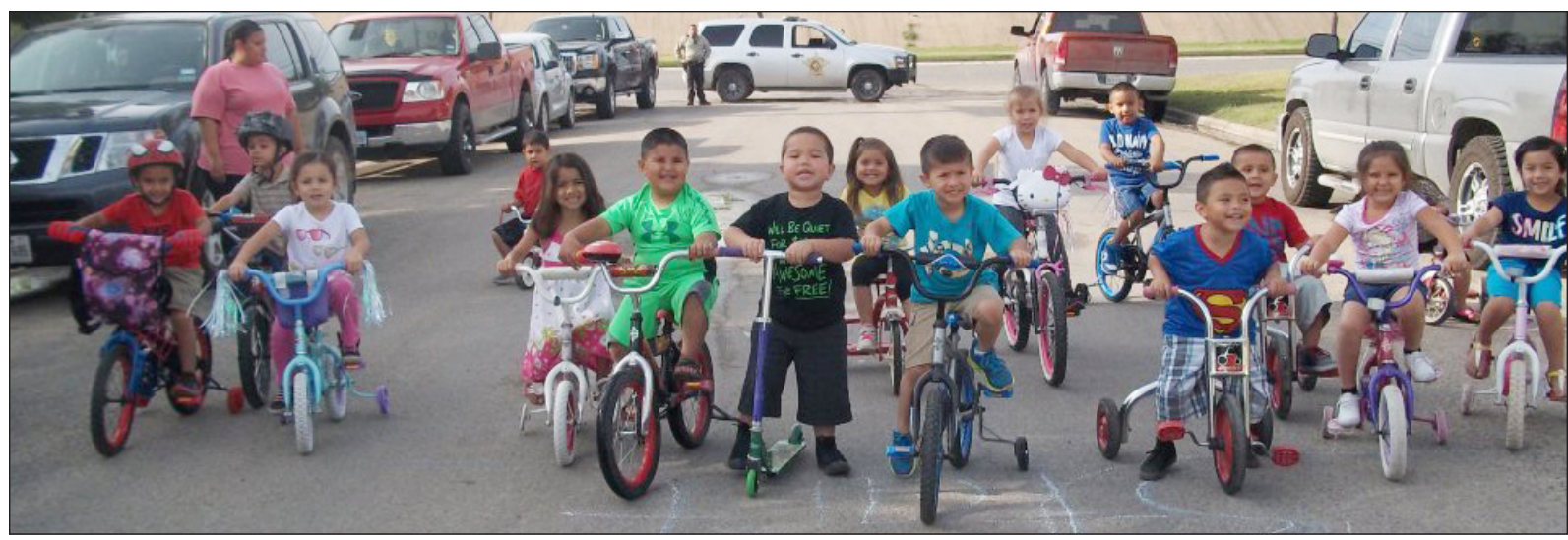
OZONA HEAD START HOSTED A ST. JUDE TRIKE A-THON RECENTLY AND RAISED OVER $400 TO HELP WITH RESEARCH AND TREATMENTS.