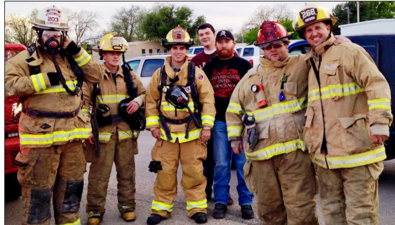
MEMBERS OF THE OZONA VOLUNTEER FIRE DEPARTMENT walked a lap and were honored for supporting Crockett County Relay For Life.