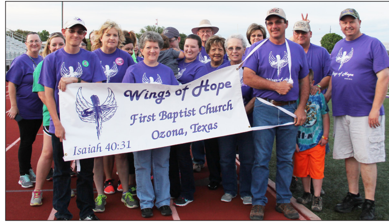
WINGS OF HOPE FIRST BAPTIST CHURCH OF OZONA