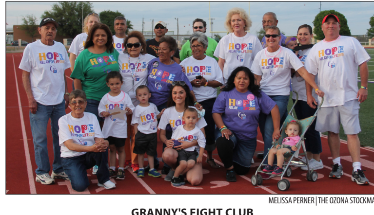
GRANNY'S FIGHT CLUB