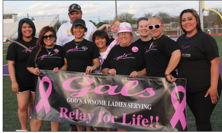
GALS (GOD'S AWESOME LADIES SERVING) NEW BEGINNINGS CHURCH