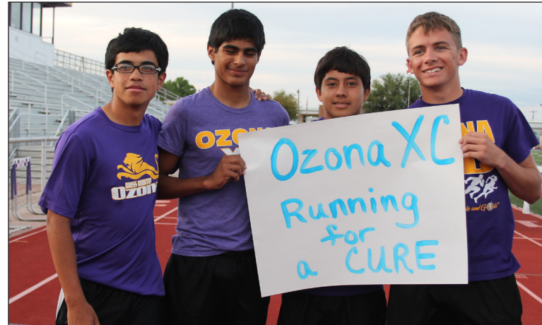
OHS CROSS-COUNTRY TEAM ran a 50-mile, 200-lap relay race and raised $200. The team started at 7:30 p.m. and finished around 1 a.m.