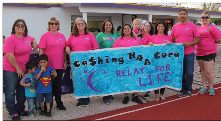
CASHING N4A CURE OZONA BANK