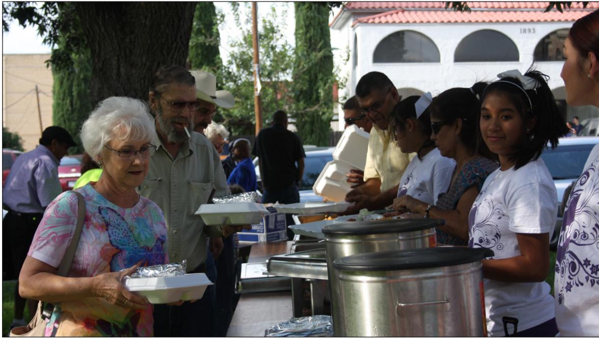
JOE HERNANDEZ | THE OZONA STOCKMAN

· Lemon Baked Chicken, Creamed Peas, Steamed Broccoli, Whole Wheat Bread, Blushing Pears, one percent Milk