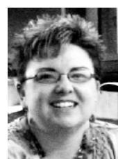
WHAT'S ON MY MIND