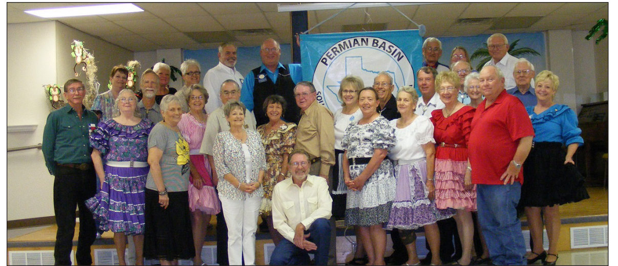
THE PERMIAN BASIN SQUARE AND ROUND DANCE ASSOCIATION held their dance Saturday at the Crockett County Senior Center in Ozona.