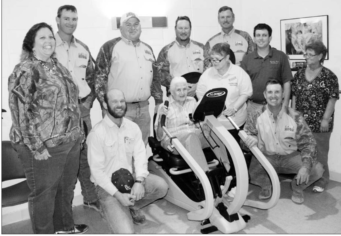
CROCKETT COUNTY DEERFEST recently gave donations to the Ozona Community Center for a new sign (top) and to the Crockett County Care Center for a new NuStep machine to help residents with rehabilitation (bottom).