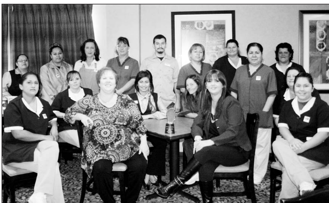
EMPLOYEES OF HOLIDAY INN EXPRESS & SUITES IN OZONA gather around the "Quality Excellence" Award they received recently from the International Hotel Group.