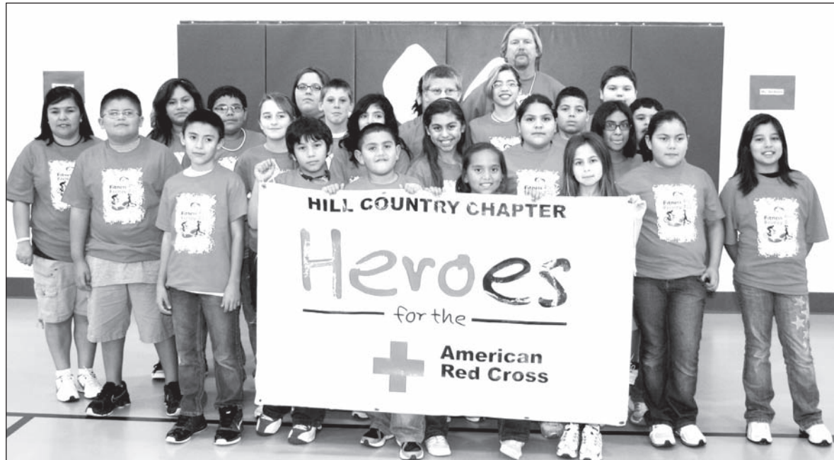
OZONA ELEMENTARY FIFTH GRADE STUDENTS recently participated in Fitness Frenzy Program to raise funds for the American Red Cross. The students raised more than $900 during their campaign.