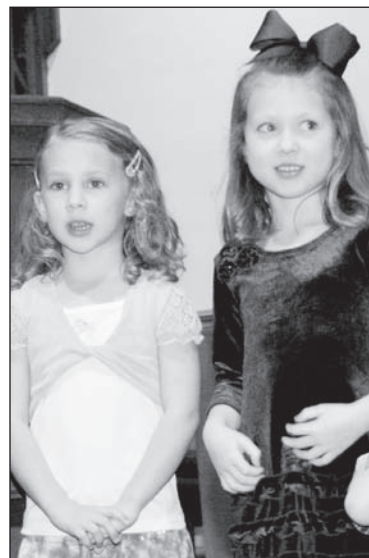
THE ANNUAL COMMUNITY THANKSGIVING SERVICE Sunday evening had lots of praise and singing from people of all ages from several local churches.