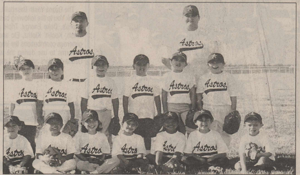
VILLAGE DRUG ASTROS