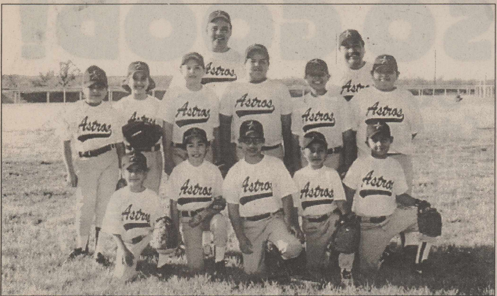
NATIONAL OIL ASTROS