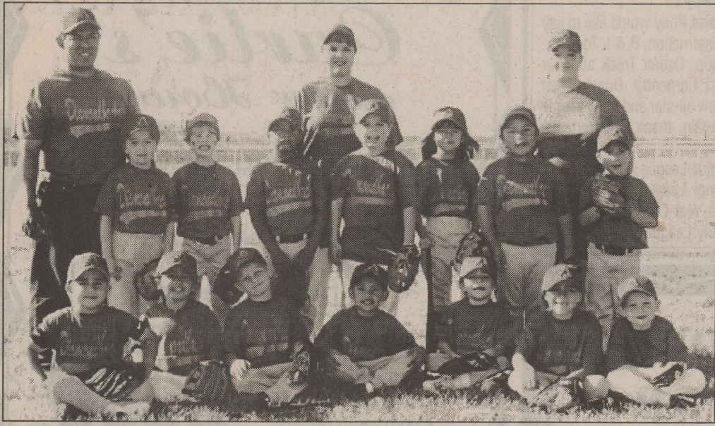
MIKE'S CAR CARE DIAMONDBACKS