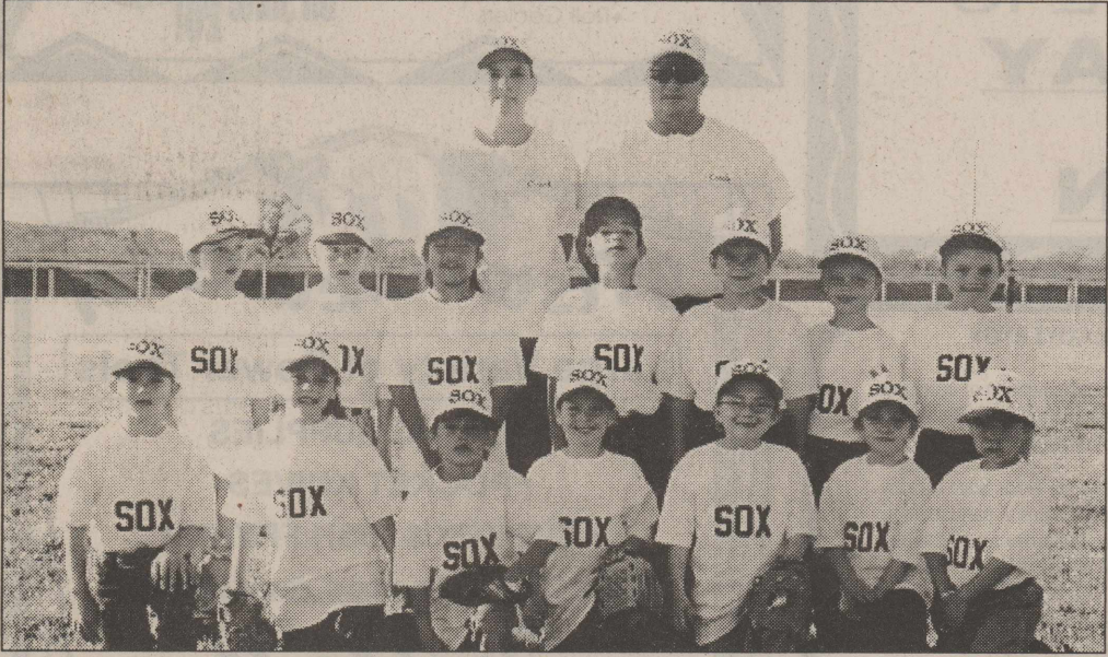
LILLY CONSTRUCTION SOX