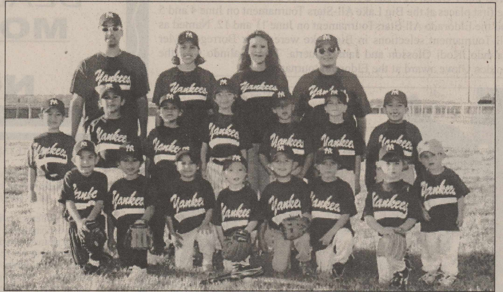
TRIPLE C HARDWARE YANKEES