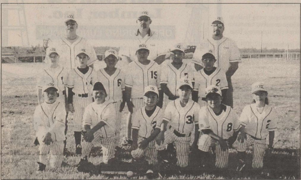
LILLY CONSTRUCTION SOX