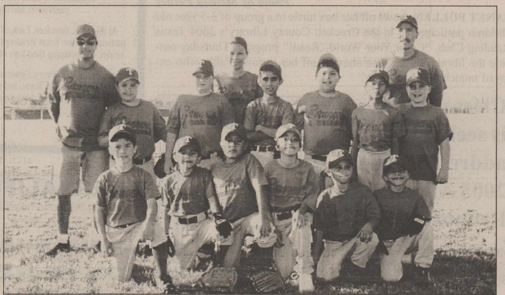
DEHOYOS LAW RANGERS