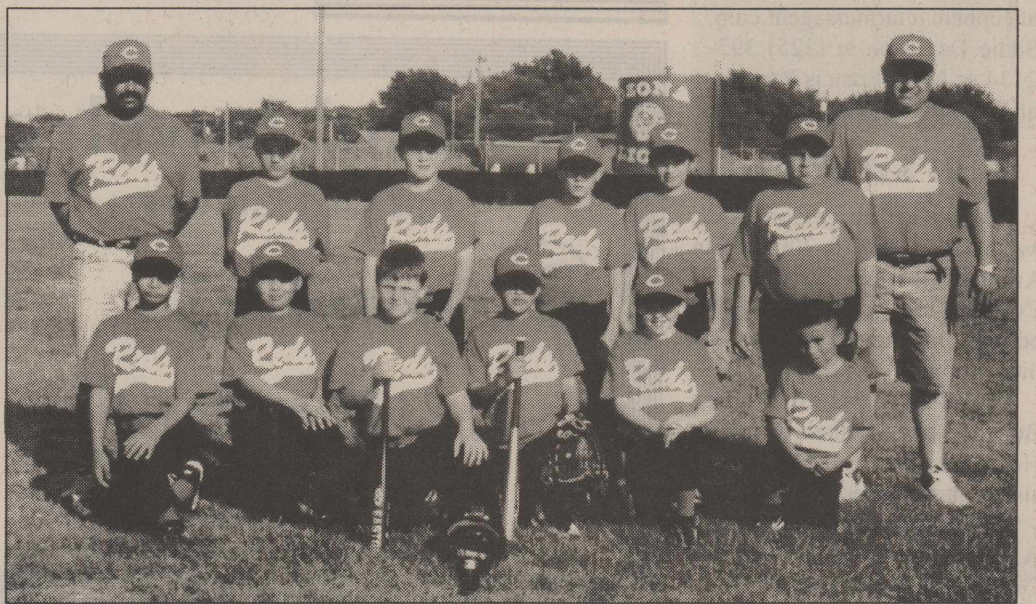
MARIA'S DESIGN LINE REDS