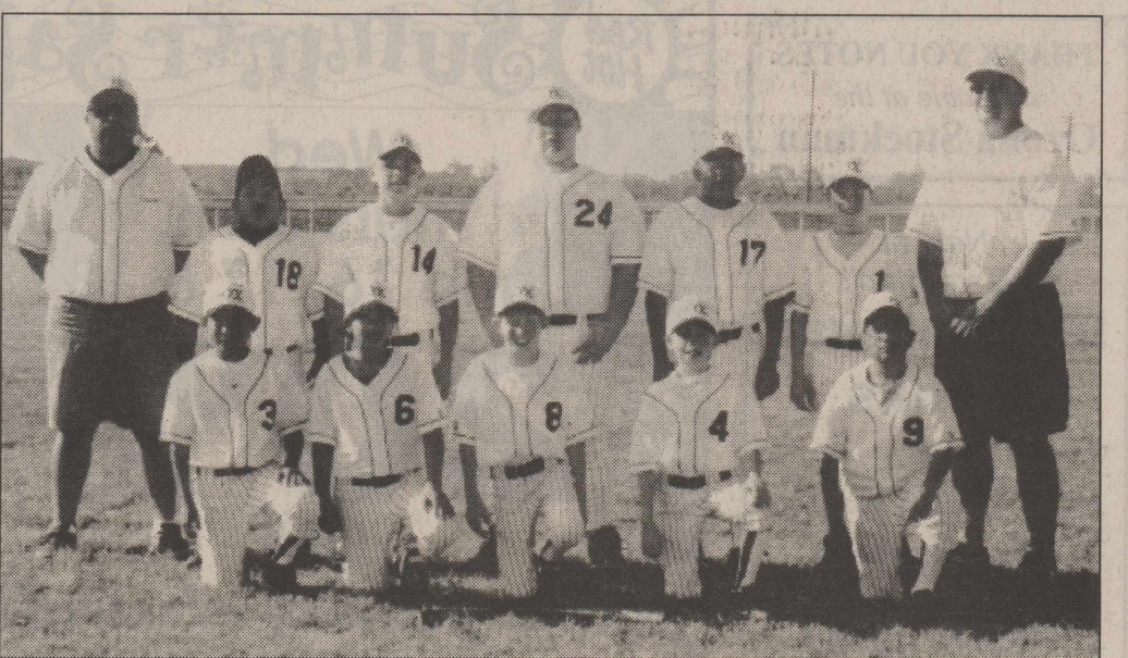
LILLY CONSTRUCTION SOX