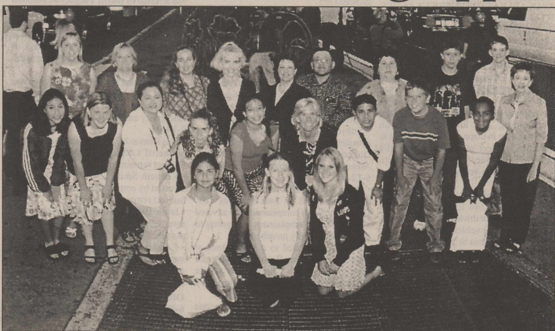
OZONA MIDDLE SCHOOL STUDENTS and their sponsors pose in Times Square at New York City, after attending a performance of "Hairspray."

Twenty-two Ozona Middle School students and sponsors recently returned from a four-day, three-night trip to New York City.