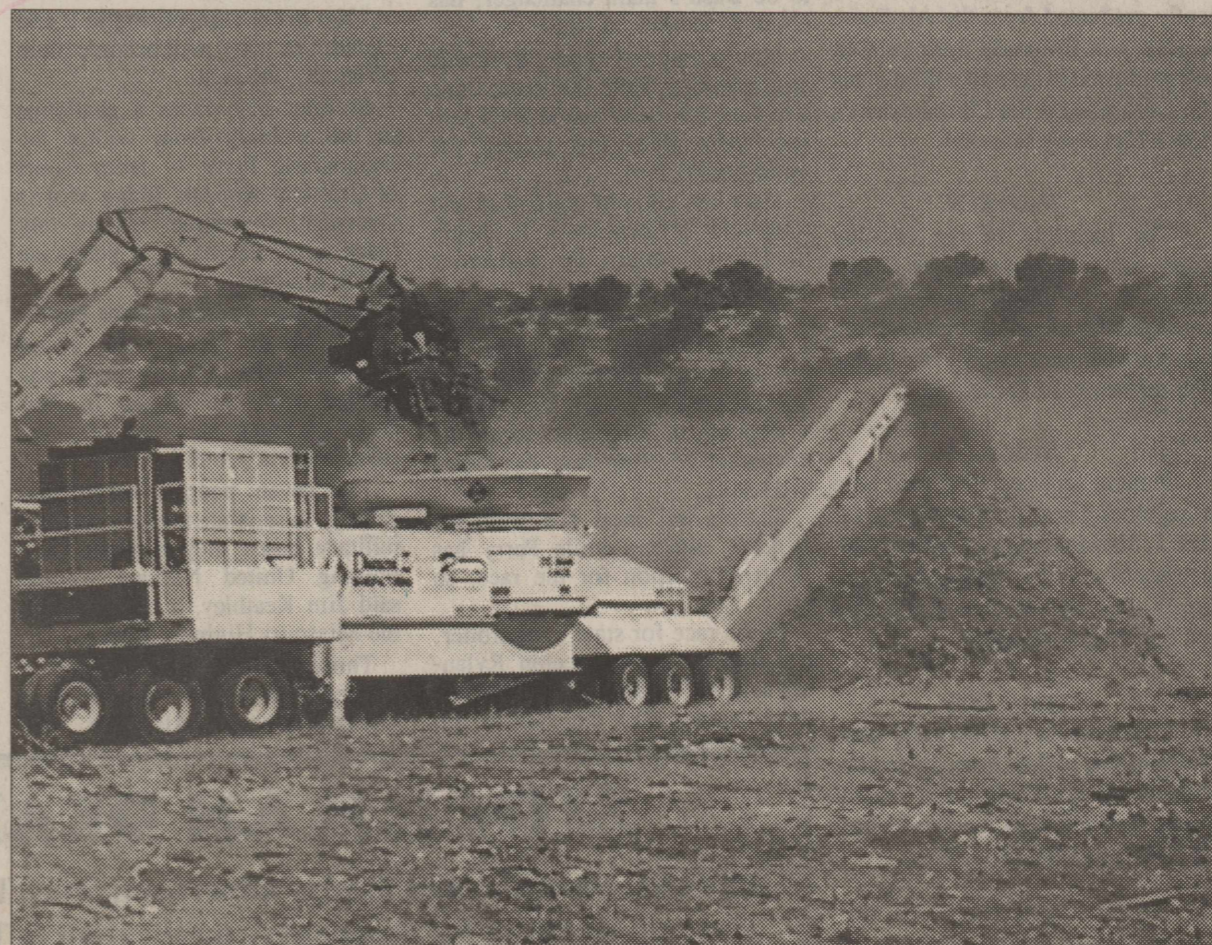
THIS 1000 HORSEPOWER TUB GRINDER FROM THE AUSTIN WOOD RECYCLING CO. of Austin stirs up a lot of dust as it chews through the county's stockpile of 7,000 cubic feet of wood. The equipment was rented with funds received from a Concho Valley Council of Government grant.

"We hope this got the majority of rough material in Crockett County," Keilers said of the project. The county is actually the receiver of the grant; the water district helps expedite the project. County officials have already agreed to petition the Council of Governments to be allowed to participate in a similar program next year.