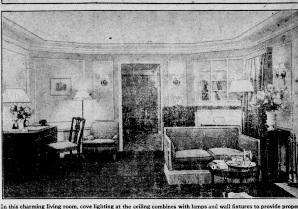
In this charming living room, cove lighting at the ceiling combines with lamps and wall fixtures to provide proper seeing conditions for every member of the family.

WHEN homes were lighted with candles and gas jets, there was some excuse for glare spots and dark corners. Today, with the cost of electricity coming down all the time, and with the improvement in electric light bulbs and lamp designs, there is no reason for any family to cheat their cycle of the light they really