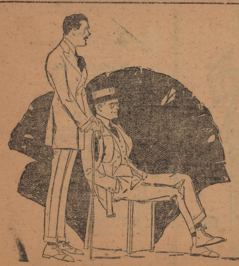
Kahn Made to Clothes