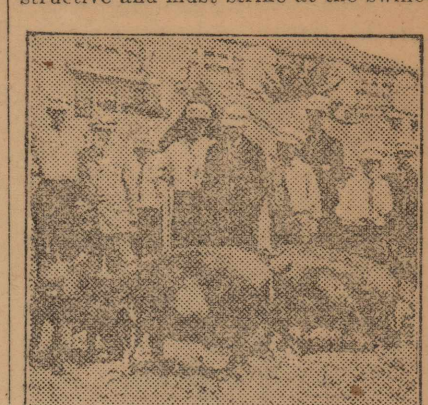
Members of Pig Club and Result of Their Work.

The pig-club agent is the leader of the animal-club work in the state. It is his duty to provide technical instruction for the club members: to provide supervisors or local leaders and to train them so that they may impart the information to the members. In some cases the duty of organizing the pig clubs falls to the lot of the state agent, while in other states the state leader of general club work and his staff attend to the organization. He works with and through the county agent force and makes use of such local leaders as are available. He projects his vision of the work into the co-operation. His work must be constructive and must strike at the swine-