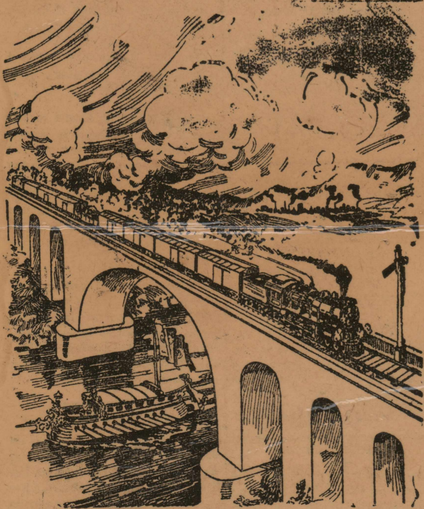
THE BIRTHPLACE OF PROGRESS.

GREEK civilization gave us the arch and made it possible to build structures that support great weights. The Phoenicians made the first boat and the Harbor of Phenicia became the birthplace of the navies of the world. Since the beginning of creation, we have depended upon men who can build for our progress. We need in State government builders who can construct an arch strong enough to support the ponderous machinery of Twentieth Century civilization and create conditions that will make Texas the birthplace of the world's progress.