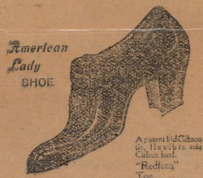
American Lady SHOE

Patent leather toe flexible sole "Redum" Toe