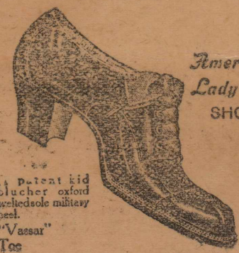
American Lady SHOE

Patent leather toe flexible sole "Vassar" Toe