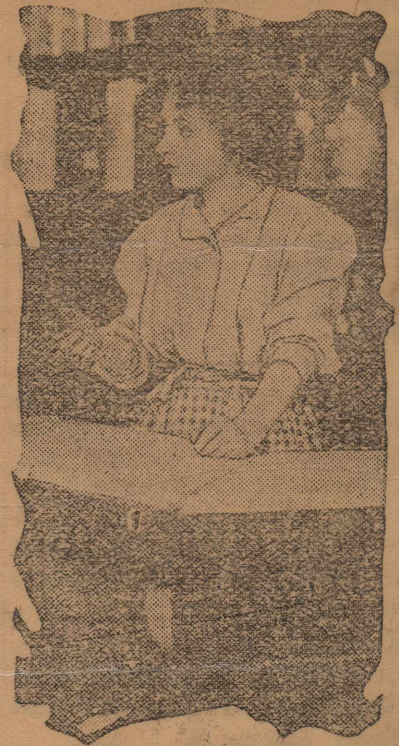
ONLY HER SENSE OF DUTY SUSTAINED

, well: He's kind, very kind. With this young man in here and everything gettin' fixed up and new stock