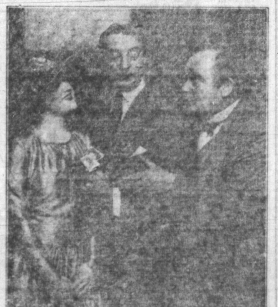
SCENE FROM "CAPPY RICKS."