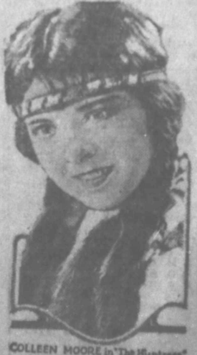
COLLEEN MOORE in "The Huntress"

Here, indeed, is something different, something refreshingly original—the rollicking story of an Indian bred girl who set her heart upon a white mate.