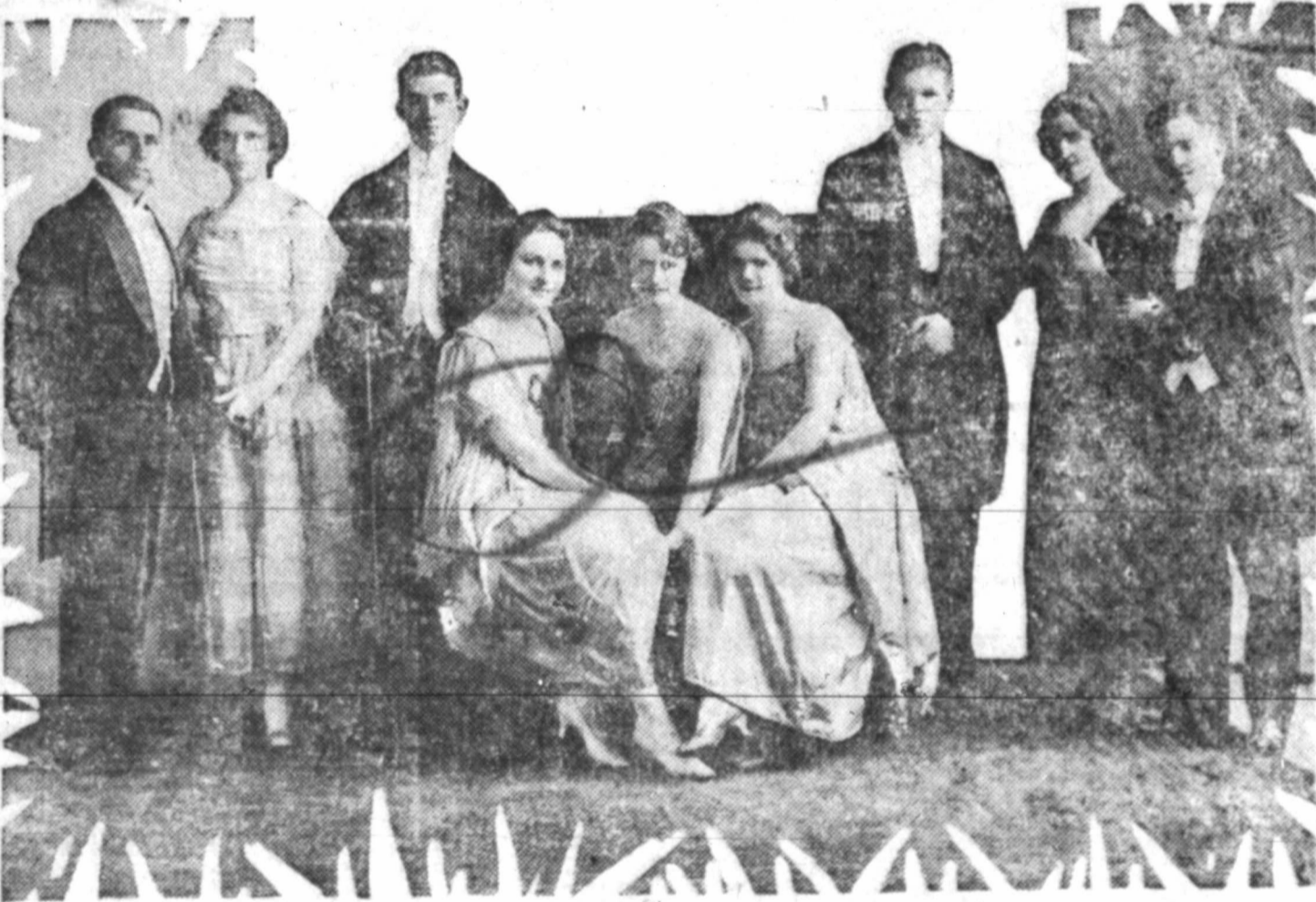
PREMIER CONCERT ARTISTS