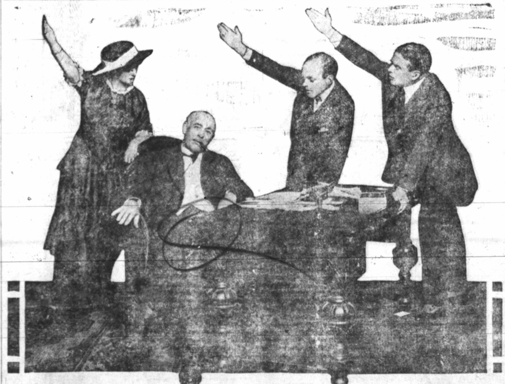
Greatest Comedy-drama of the past decade. "It Pays to Advertise" Played by the New York cast that made it famous. Greatest dramatic production ever on your Chautauqua program. Laugh with New York and Chicago. Ask anyone who has seen it.

May God who reigns above Bless those who seek her path.