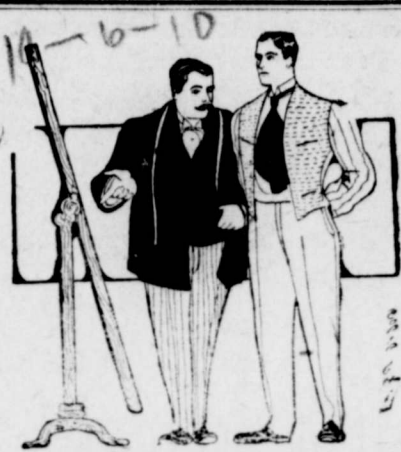
A FIRST-CLASS TAILOR

will not let a garment leave his shop unless it is perfect. That is our habit. We depend on every production of ours to advertise us. We don't propose to have a single one advertise us