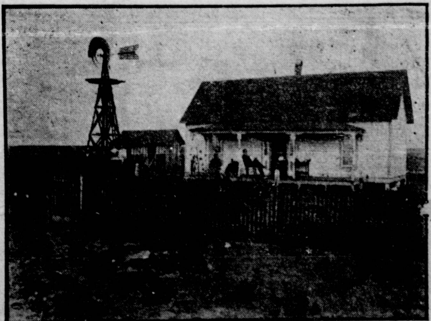
"THE AVALANCHE PARSONAGE."

The climate is delightful and healthful, the atmosphere is bracing, the nights always cool even in the period of midsummer heat. The water is abundant, and of a quality that leaves nothing to be desired.—Extracts from The Earth .