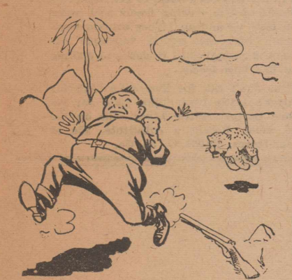
YOU'L LSTEP SOME

if you can get over a better one than this one. Wife: "If I tell you anything it