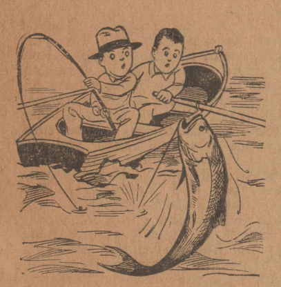
THE BIGGEST FISH

yourself from the hot nerve breaking and exhaustive efforts of wash day. Our family finish service means satisfied work and economy. Our methods are satisfied work and economy. Our methods are satisfied work and economy. Our methods are satisfied work and economy. Our methods are satisfied work and economy. Our methods are satisfied work and economy. Our methods are satisfied work and economy. Our methods are satisfied work and economy. Our methods are satisfied work and economy. Our methods are satisfied work and economy. Our methods are satisfied work and economy. Our methods are satisfied work and economy. Our methods are satisfied work and economy. Our methods are satisfied work and economy. Our methods are satisfied work and economy. Our methods are satisfied work and economy. Our methods are satisfied work and economy. Our methods are satisfied work and economy. Our methods are satisfied work and economy. Our methods are satisfied work and economy. Our methods are satisfied work and economy. Our methods are satisfied work and economy. Our methods are satisfied work and economy. Our methods are satisfied work and economy. Our methods are satisfied work and economy. Our methods are satisfied work and economy. Our methods are satisfied work and economy. Our methods are satisfied work and economy. Our methods are satisfied work and economy. Our methods are satisfied work and economy.