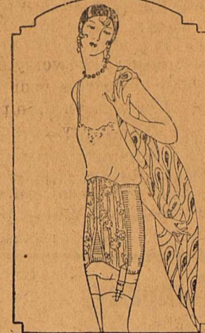
This is one of the many models we would like to show you.

Model No. 338 in an attractive snug-fitting step-in girdle has comfort and gives soft support to slender figures. It assures you of an attractive appearance. Price $3.50. This garment is an all elastic girdle. This model may be had in a nicer material of Charmosette Style No 5407 price $7.50 and also style No. 6607 for $8.75. This step-in girdle is the model one should wear not preferring a heavier model