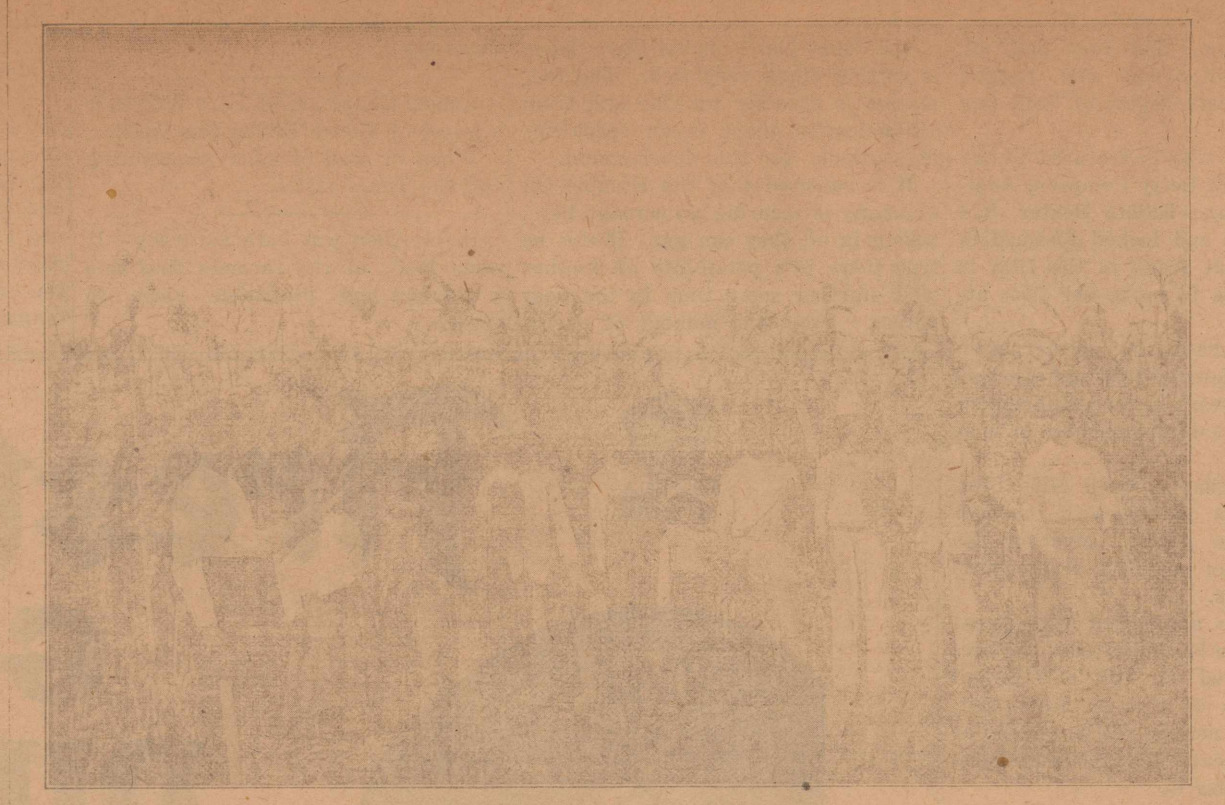
Scene on Farm, Dickens County

NEW OR REPAIR At ROARING SPRINGS AUG 8-15