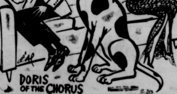
DORIS OF THE CHORUS "Oh, he's harmless, Mr. Prowly. Just don't look at me while you're here, and you'll be safe enough!"