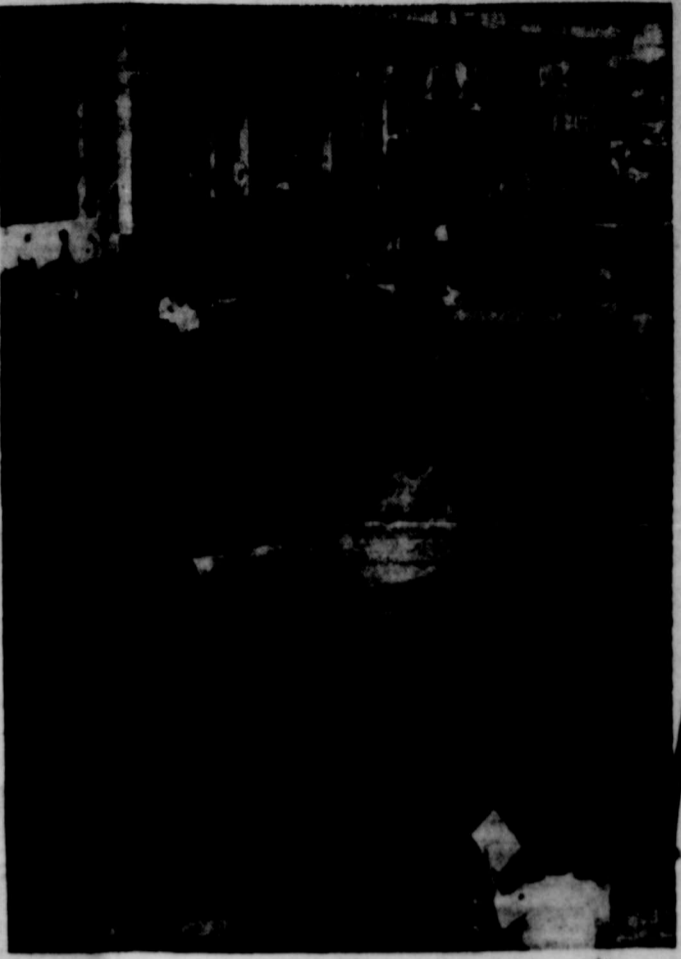
For the first time, the Army has permitted photographs of its new Patton 48 medium tanks rolling from the Chrysler Delaware Tank Plant assembly line. Military experts say this new spectacular tank will whip any other tank in the world. This million square foot tank plant produced and delivered its first Patton 48 to Army Ordnance on April 11, 1952, less than a year from the date the first steel was raised.