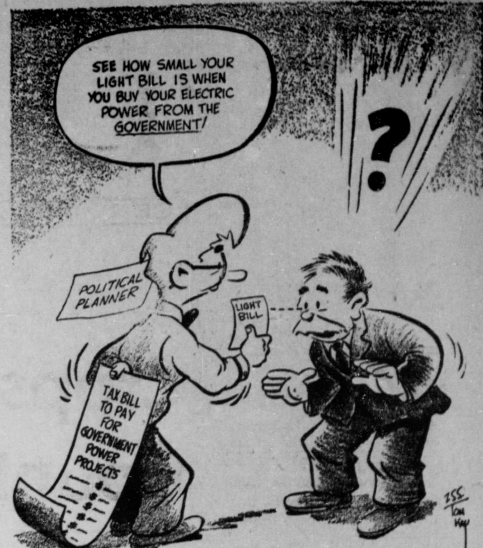
But What About The Second Bill?

dramatic tales of the fortunes and misfortunes of a pioneer trek into Oregon at the time of the gold rush, benefits gloriously from its actual backgrounds in Oregon, where filming was centered against the dramatic backdrops of Mt. Hood, the Columbia River and other spectacular Oregon skylines.