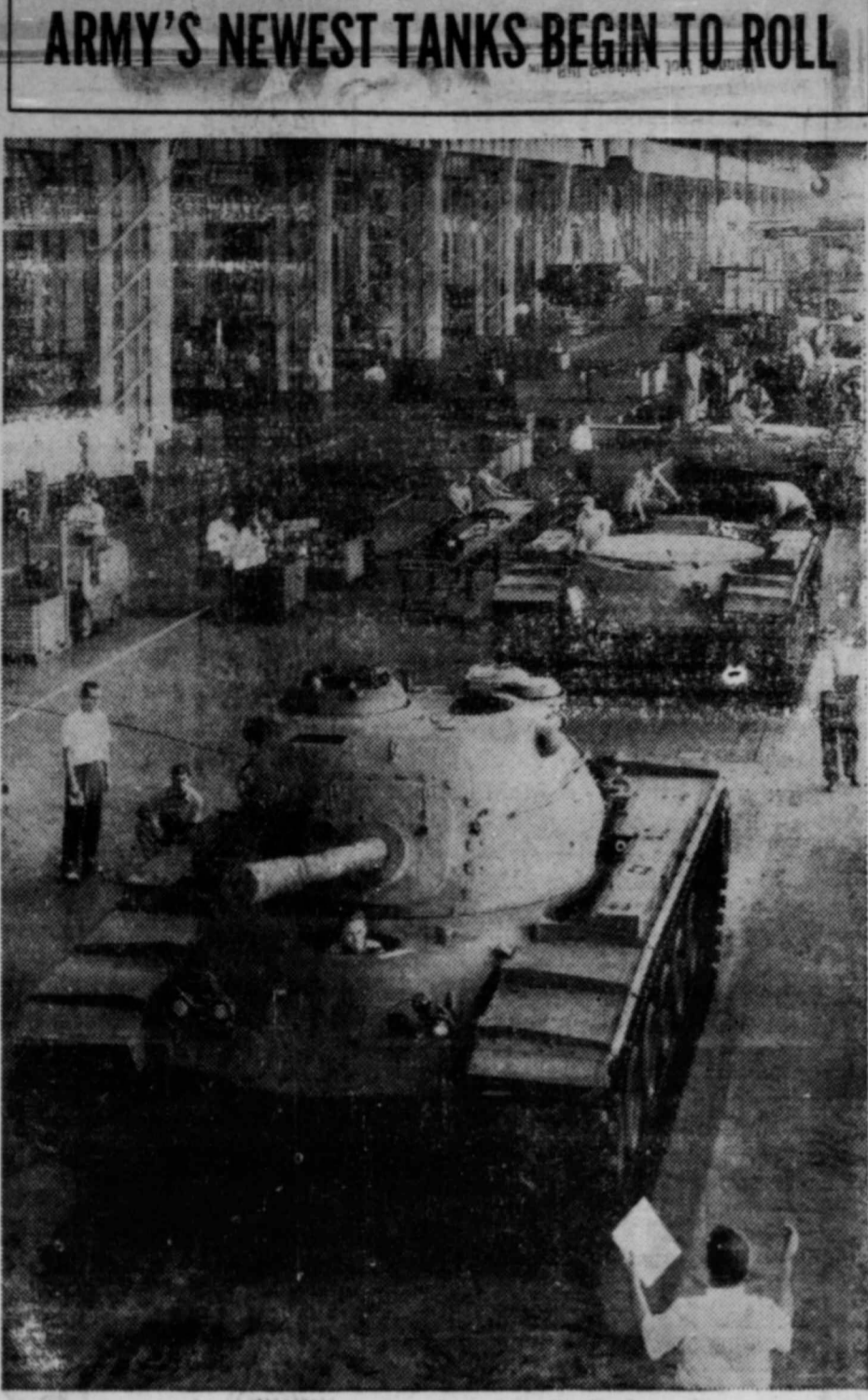
For the first time, the Army has permitted photographs of its new Patton 48 medium tanks rolling from the Chrysler Delaware Tank Plant assembly line. Military experts say this new spectacular tank will whip any other tank in the world. This million square foot tank plant produced and delivered its first Patton 48 to Army Ordnance on April 11, 1952, less than a year from the date the first steel was raised.