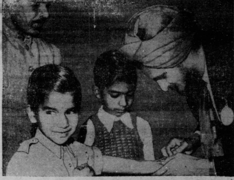
This boy from Lucknow, India, is the seven millionth child to be tested for tuberculosis in the BCG campaign which the United Nations International Children's Emergency Fund (UNICEF) and the World Health Organization (WHO), are assisting in India. Thus far nearly 2,500,000 children have been vaccinated. By the end of 1953 it is hoped that there will be 100 teams working in all of India's 29 states. Pulmonary TB is one of India's worst health problems.