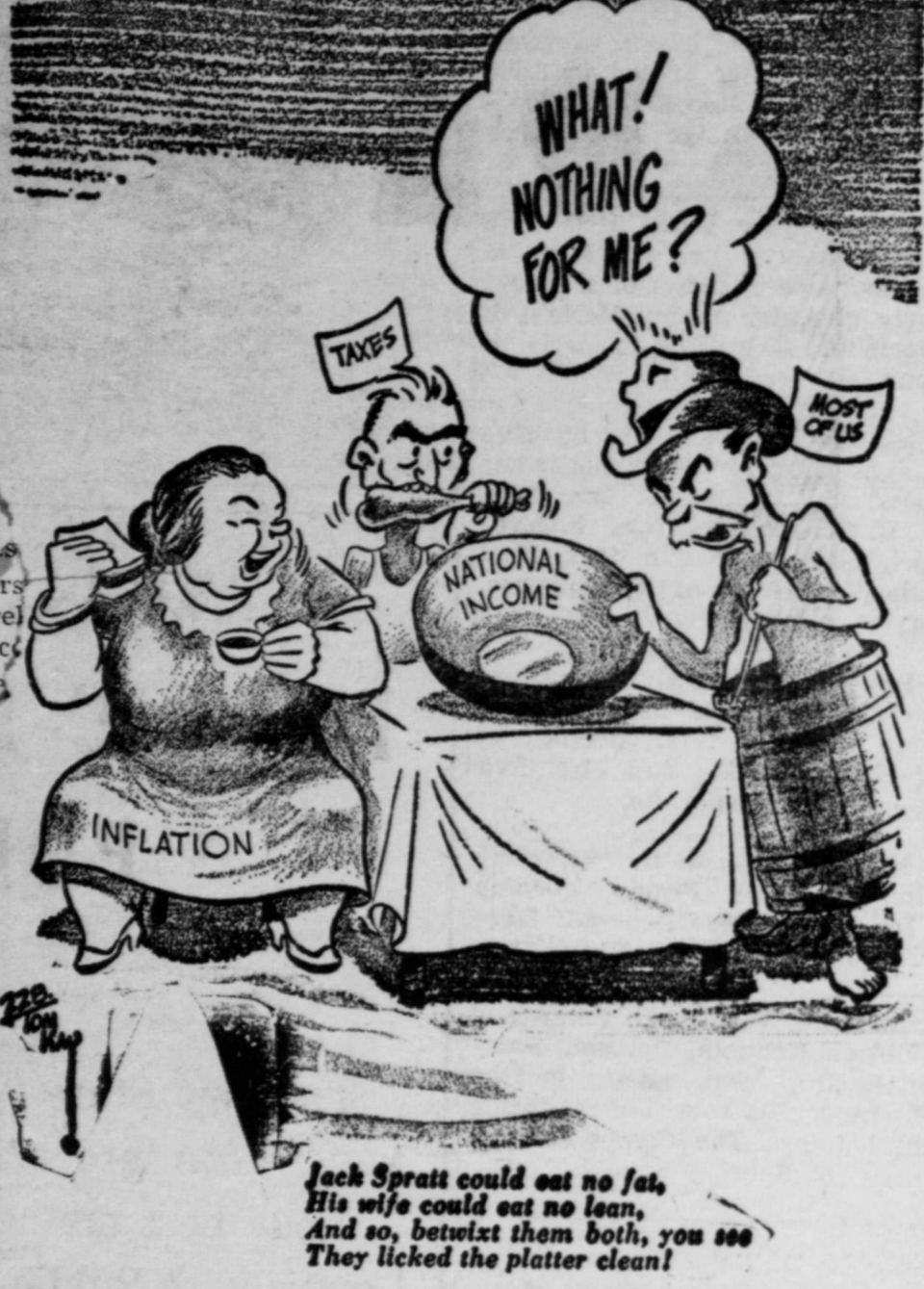
Jack Spratt could eat no fat, His wife could eat no lean, And so, betwixt them both, you see They licked the platter clean!