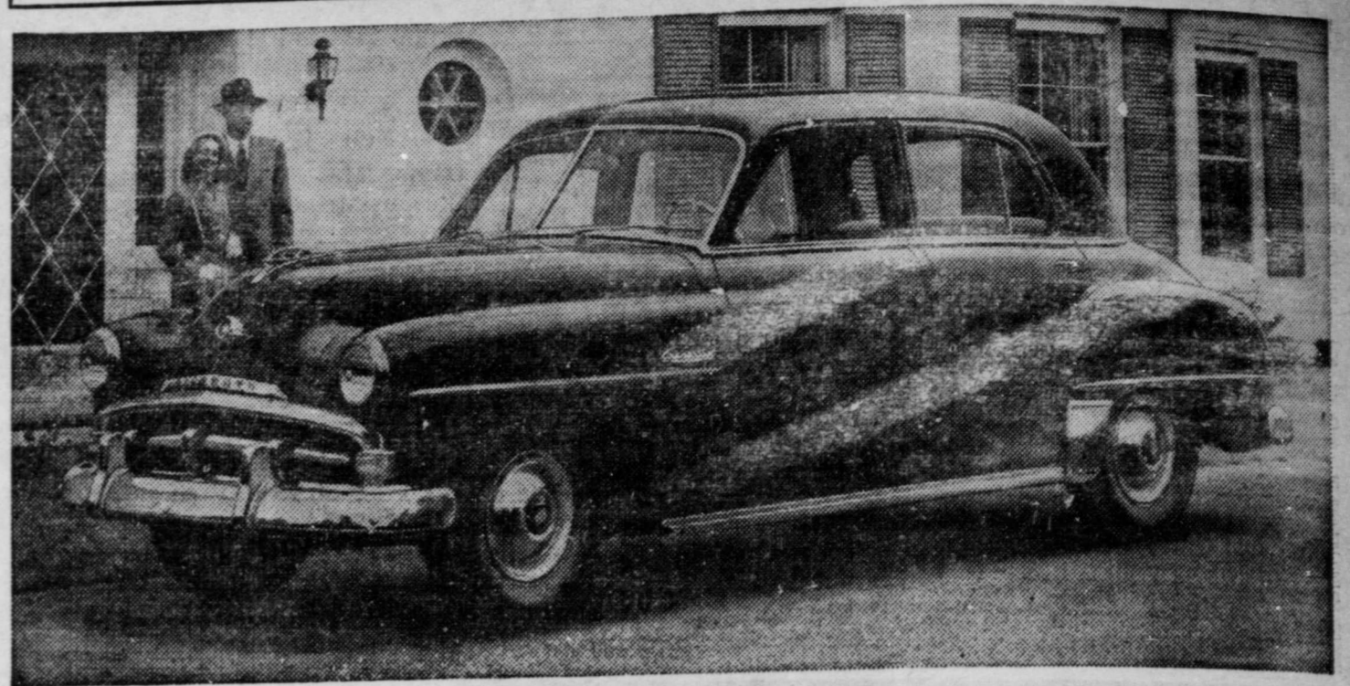
Here's the new Plymouth for 1952, a more beautiful, smoother operating, easier riding, safer car which features 46 important improvements. There is new beauty in the car's road-hugging, sweeping appearance, and color harmony perfection in the new interiors, which are Tone-Tailored with quality fabrics. The luxurious interiors blend beautifully with the exterior colors. The car has all the features for comfort, economy, safety and durability which have become traditional with Plymouth. Shown above is the new four-door Cranbrook sedan.