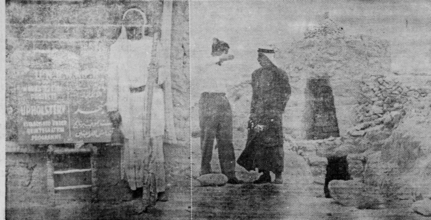
As part of its rehabilitation activities for Palestine refugees, the United Nations Relief and Works Agency has initiated a program under which small loans are made to individuals, cooperatives or other groups for the development of small industries and enterprises which will bring about the