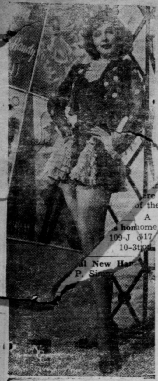
Lucky the bull that enters the ring with this goodlooking mutator! Pretty Arlene Dahl, popular MGM star, wears an eye-catching bull-fighting costume of bright red cotton velveteen. (Don't worry, fellas—Arlene just donned the velveteen bullfighting costume to accommodate the Mexican Tourist Association.)