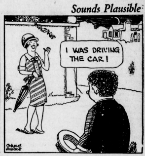
Events in the Lives of Little Men