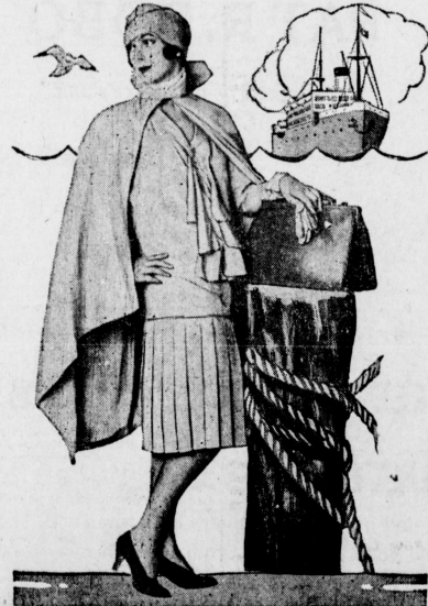
Carries Out One-Color Scheme.