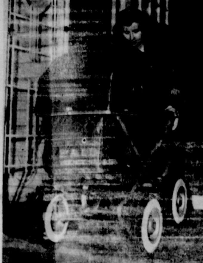
Dad has nothing on Junior when it comes to the "rubbish ride" of low-pressure tires—and mother can push the baby buggy about so easily that the daily stroll is a new found pleasure.

With the company manufacturing a full line of industrial tires for use on lawn mower, wheelbarrow, or just anything that runs on wheels, engineers of The General Tire & Rubber Company decided it was time to think of Mommy and Junior. The baby buggy with wide-base industrial tires was the result.