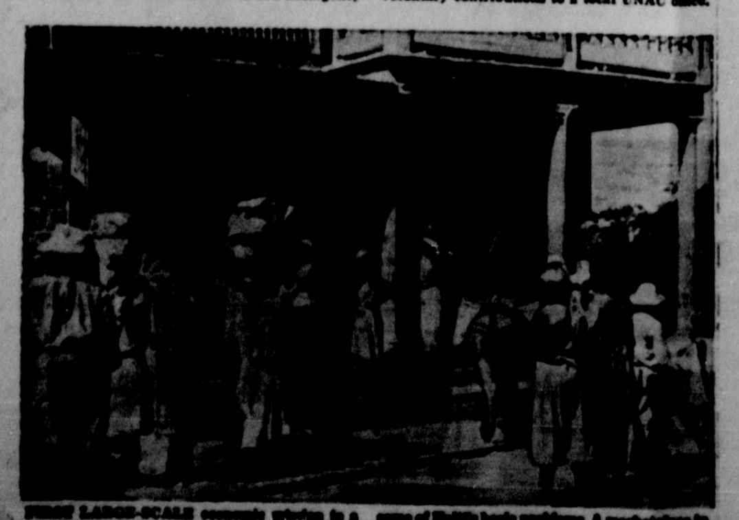
FIRST LARGE-SCALE community activities in a country were organized by U.N. and later sponsored agencies in 1948 to find solutions to some of the world's most serious problems. A meeting in the United Nations General Assembly, which had one of the world's largest populations, is shown here.