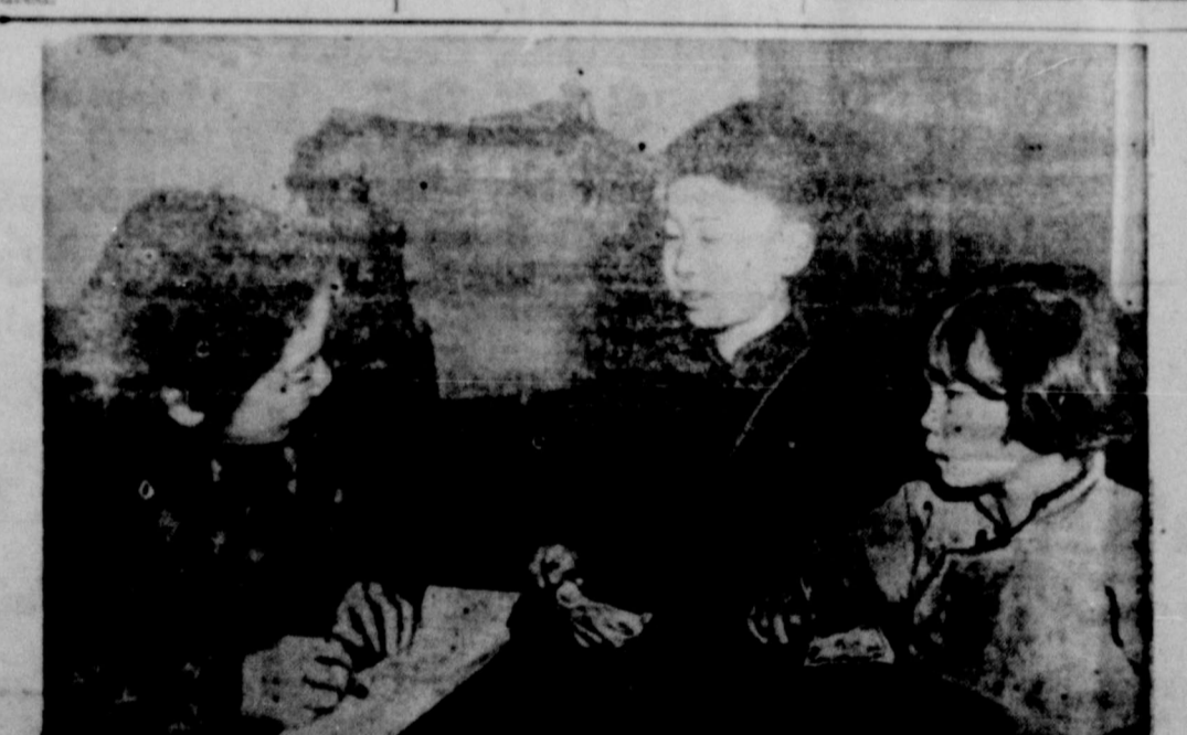
PEOPLE in more than 50 countries gave some $50,000,000 in 1948 to the United Nations Appeal for Children (UNAC). Much of the money went to the U.N. International Children's Emergency Fund, which is inoculating 15,000,000 youngsters against TB and is helping feed 4,500,000 daily.