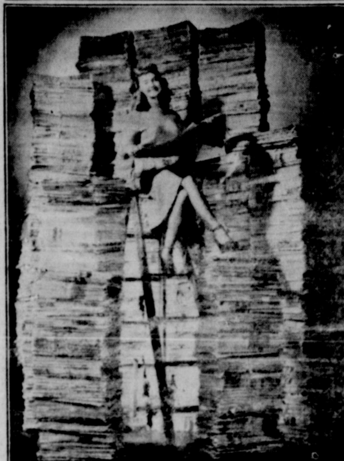
Chevrolet's biggest newspaper advertising campaign will use 5,972 dailies and weeklies to announce new models January 22. Dwarling Tomi Banaib, here's what 5,972 newspapers look like, each representing an individual publication.